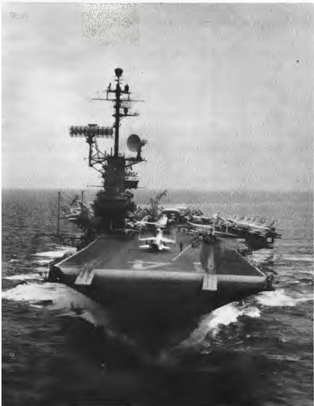
The champlain takes great delight in joining Dottie during one of her solo numbers. This combination was hard to top.