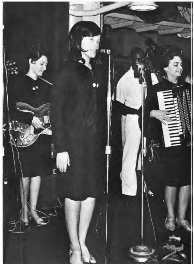
During a performance on the USS Ticonderoga, Reba entertains the Navy and they love it. Reba was the youngest performer ever to play a war zone area.