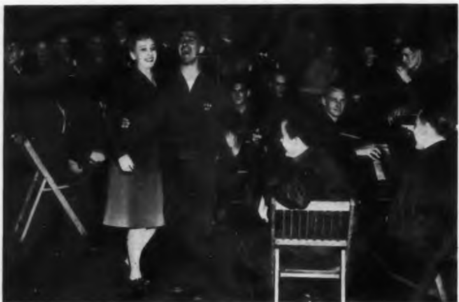
Washington, D. C.—A piano, two guitars and a mandolin make life brighter here for war convalescents in the Forest Glen Annex of the Walter Reed army hospital, a building which formerly was the National Park Seminary, an exclusive fin-

ishing school for girls. Here in the midst of 160 woody acres, about 450 soldiers and five WAACs, all battle zone casualties, are fighting their way back to health. Music, fun and laughter are vital elements of the regime.