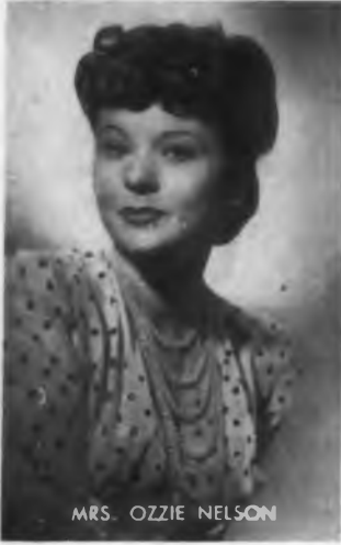
MRS. OZZIE NELSON