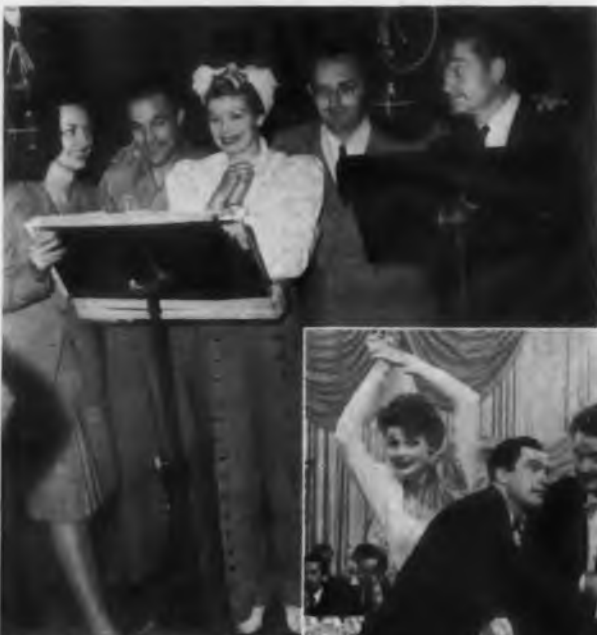
Hollywood—Most movie fans understand that recording and photographing processes are done separately on a movie set, but here's how it actually looks. Above: Virginia O'Brien, Gene Kelly, Lucille Ball, Tommy Dorsey and Red Skelton make the sound track of Friendship for the Picture , DuBarry Was a Lady . Below: This is how the same characters, but in different order, will look on the screen when you hear the song coming at you. In front of the cameras, they go through the motions to a play-back of the sound track.