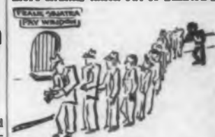
weekly pay envelope, the result of financial deals made some time before the singer became the current vocal rage.

New York—Joe Venuti and his band will be featured in a new RKO movie short, as will the Roseland ballroom and Ovie Alston's band. Joe and Ovie lead alternate orchs at the dancery.