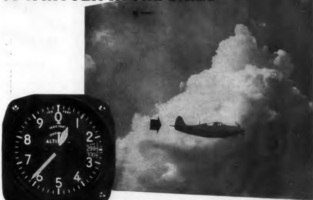
The C-12 altimeter made by Buescher is accurate to within 20 feet from sea level to 50,000 feet, yet it must be rugged enough to take the gun shock of cannon firing, dive strains, and rough take-offs and landings. It must operate perfectly at 150° F above zero and at 70° F below zero. Buescher altimeters are used in every type of Army and Navy plane from the rough, speedy fighters, to the huge precision bombers.