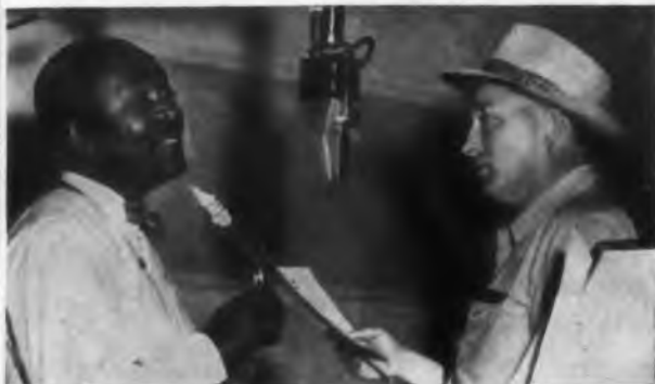
Hollywood—Just before he took off for his jaunt to Europe, Bing Crosby spent three hours in the Decca studios here, waxing four sides with Louis Jordan and his hot little combo. Two of them, My Baby Said Yes and Your Sox Don't Match , are said to be killers.

tween the best white and colored jazzmen!