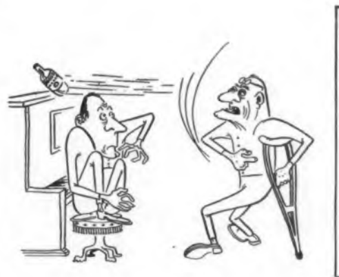
... six piano solos, including ... Grandpa's Spells ...