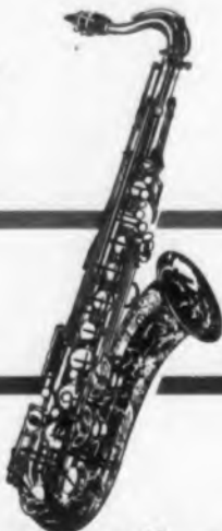
Buy the Selmer Super-Action Tenor and get $65 case at no extra cost!