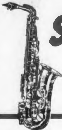
Buy the Selmer Super-Action Alto and get $60 case at no extra cost!