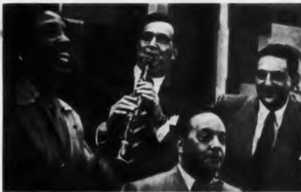
New York—Giving a different swing to the Guy Lombardo theme song, Auld Lang Syne , are singer Maxine Sullivan, clarinetist Benny Goodman, and pianist Vincent Lopez. They appeared on the W's , the People radio-television show recently to congratulate Guy upon his 25th anniversary in the band business. An appreciative Lombardo watches from the right.