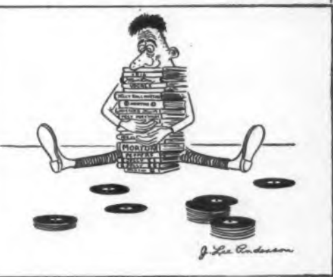
... Ferdinand Morton left behind a rich legacy ...