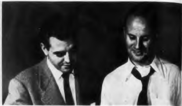
New York—Part of Victor's new "stock company" plan, in which a band, combo, and singers are on call for whatever needs immediate waxing, are singer Harry Prime, left, and band leader Ralph Flanagan, right. Story on Flanagan in adjoining column.

back in ballads started his professional career by spending seven years as pianist and arranger for Sammy Kaye. He was rescued from this by the war, an event which landed him in the U. S. maritime service band at Sheepshead Bay, N. Y., again as pianist and arranger. After the war he devoted himself exclusively to arranging and at one time was showing simultaneously for Sammy Kaye, Charlie Barnet, and Boyd Raeburn.