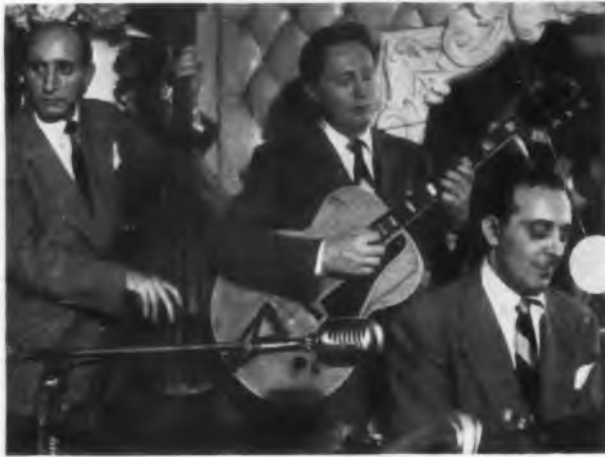
Chicago—Seems incredible, but Soft Winds, above, say that the story accompanying this photo is the first on their unit to have appeared in any trade sheet. 'Bout time, for though they feel a new spirit a-movin', they say they've been on the same track for a long time. Bass is John Frigo, guitar Herb Ellis, and piano Lou Carter.

They've adapted Edgar Allan Poe's poem, Annabelle Lee , into an effective program piece, and have written new words for Pennies from Heaven , with new lyrics being a paean to bop. Woody Herman's next release, Detour Ahead , was composed by the Soft Winds. Even Hucklebuck , in their hands, becomes a tasteful display of musicianship and a lovely tune. That achievement alone should be enough to put the Soft Winds at the top of any heap.