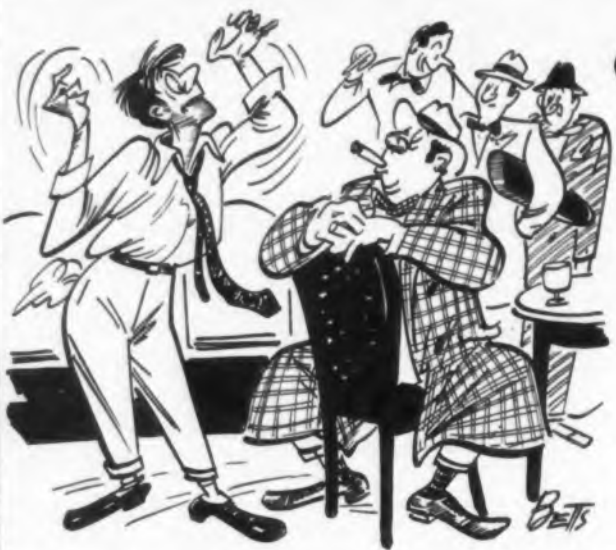
"The sponsor wants to hear what the conductor sounds like by himself."

Winnipeg, Canada To the Editors: Last October, the King Cole trio played the Don Carlos Casino here, much to the delight of music lovers. They played sets which lasted about 45 minutes and did two and