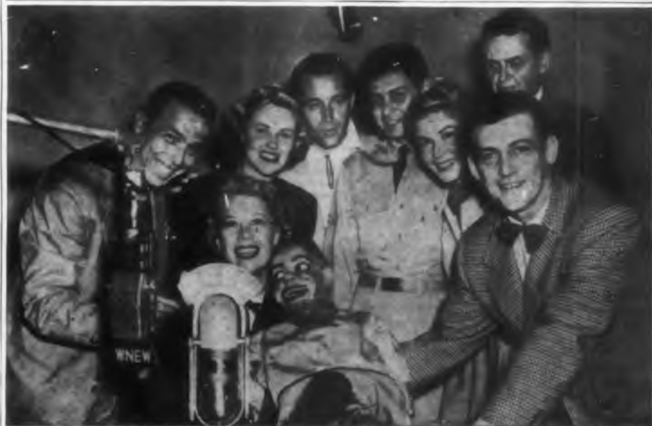
RCA VICTOR TOPPERS are represented in force at this WNEW convention of stars. They assembled on Martin Block's show to herald the station's conversion of its record library to 45 r.p.m. discs. From

Peggy's newest release is reviewed on Page 10.