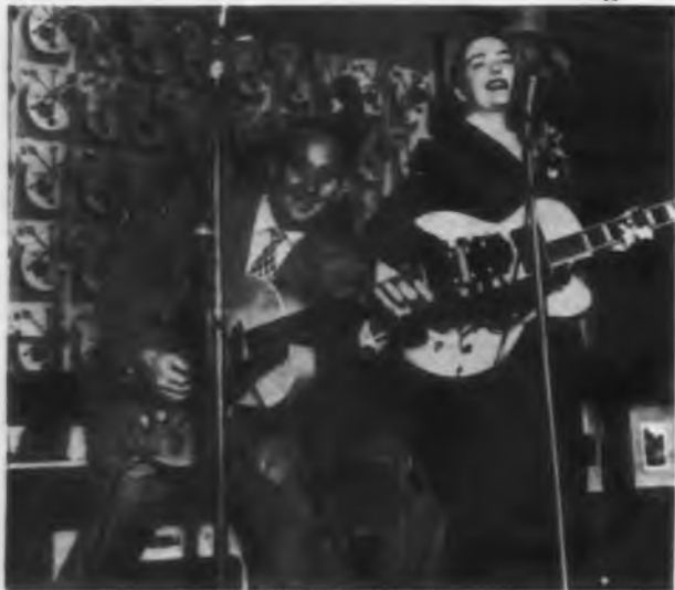
By LES PAUL

It seems to me that one of the worst evils in the music business today, or any time, is the business of imitation of styles.