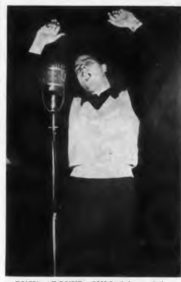
BUSY AROUND CHICAGO is Johnny Desmond, still doing nicely on Coral records and still a favorite on the Breakfast Club show.

Glad , a wonderful ballad which has been greatly neglected through the years, is sung with tremendous warmth and musicianship by Peggy. Sets a wonderful mood, still has a penetrating quality which could make it a hit this trip, and possibly the hit side of the coupling. (Decca 28313.)