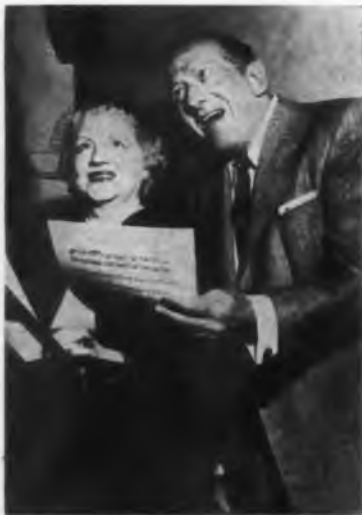
"SOMEBODY LOVES ME" is the title of a forthcoming Paramount picture starring Betty Hutton, based on the lives of Blossom Seeley and Benny Fields, shown here when they recorded a Decca album based on songs from the film.