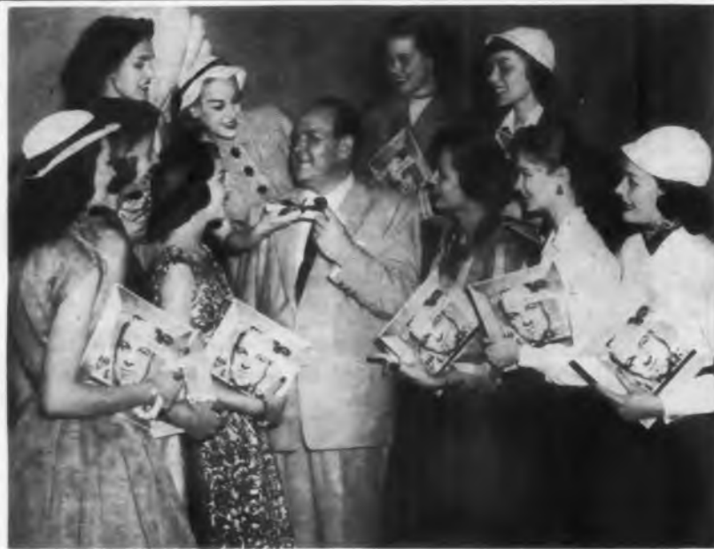
The Conover Girls help beautify this picture of Billy May.