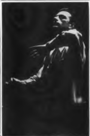
RIISING YOUNG CONDUCTOR is Guido Cantelli of La Scala Orchestra, heard in Tchaikovsky's Symphony No. 5 on the first American H.M.V. release. Cantelli is being hailed as a young Toscanini.

DID YOU KNOW that Archie Bleyer's sidemen have seven-year personal contracts with Arthur Godfrey, and that each of them nets more per week than many band leaders?