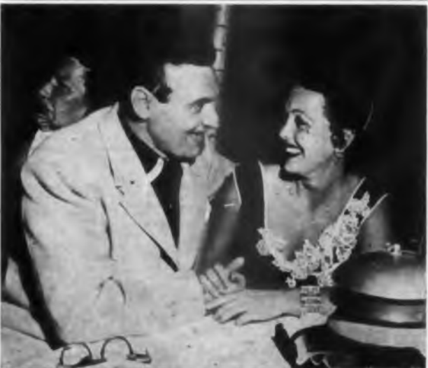
COCOANUT GROVE OPENING of Frankie Laine in Hollywood recently brought a flock of celebrities; among them Lina Romay, seen with him here.