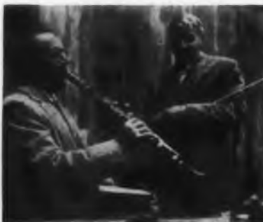
Charles Munch observes Benny Goodman at a recent recording session during which Goodman, as soloist, and the Boston Symphony orchestra, Munch conducting, recorded Mozart's Concerto for Clarinet and Orchestra in A, K. 622 for RCA Victor.

Apollo Records, absorbed with rock 'n' roll releases, took the first step into the jazz field by signing the Lord