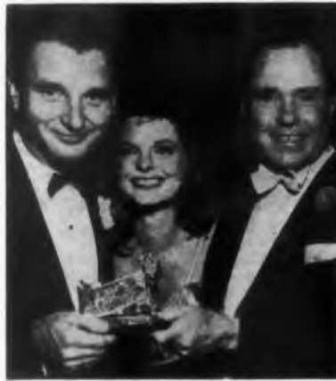
Academy of Television Arts and Sciences President Johnny Mercer presented Bobby Troup an Emmy recently in Hollywood for his Stars of Jazz show on KABC-TV, Los Angeles. Troup's fiancée, Julie London, was a proud observer.

Although not set definitely for a stage-movie presentation yet, the huge Times square landmark has a Pat Boone package scheduled for late May and another headed by singer Tony