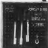
GENTLE-men of Swing LP-611 Ramsey Lewis