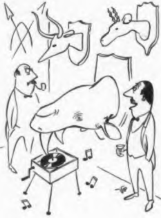
"What say we organize a safari and hunt up a JENSEN NEEDLE."

All in all, this is no earth-shaker, but it is a foot-tapper, and rarely less than good. (D.C.)