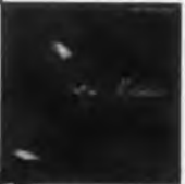
by Al Hibbler LP-601

ARGO RECORDS 4750 Cottage Grove Chicago 15, Ill.