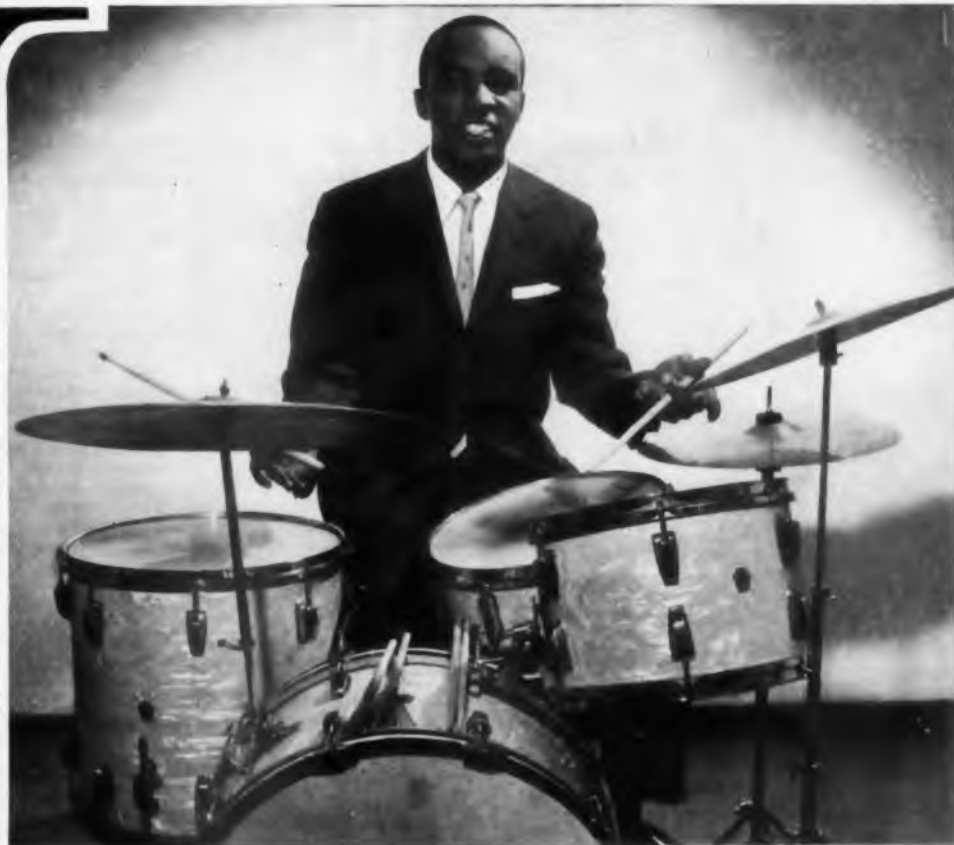
Send 10¢ for glossy 8"x10" photo of your favorite Ludwig Drummer!