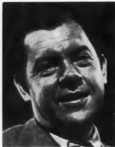
Claude Thornhill The Best Sound

Gil's influence worked in other ways as a corollary to the Davis Capitol ses-