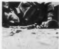
BUD SHANK QUARTET CLAUDE WILLIAMSON PACIFIC JAZZ 1230

Alto and flute treatments of standards plus Claude Williamson's new 3-part flute suite, "Tertlia."