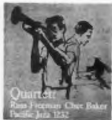
Quartet Russ Freeman Chet Baker Pacific Jazz 1232

Wonderfully relaxed studies in both swingin' and tender moods.