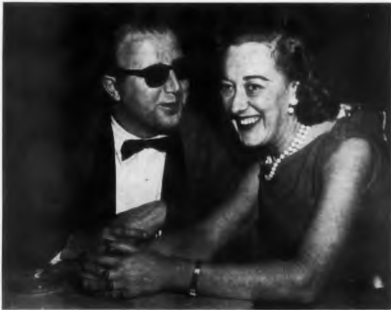
Marian McPartland with countryman George Shearing