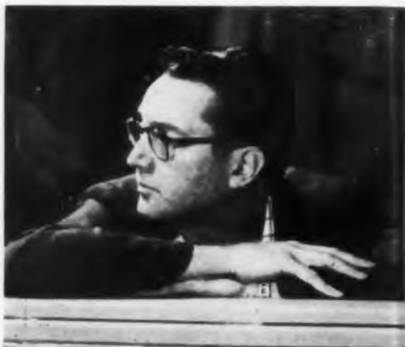
Steve Allen Time Runs Out