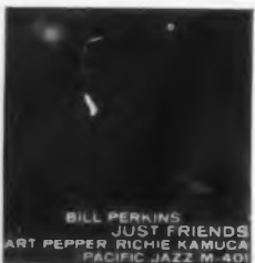
BILL PERKINS JUST FRIENDS ART PEPPER RICHIE KAMUCA PACIFIC JAZZ M-401

The new Messengers featuring Art Blakey, in exciting extended performances.