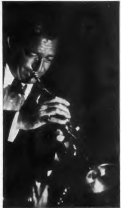
Kings in action

"What sustains them is the music. I'm sure of this. When they aren't