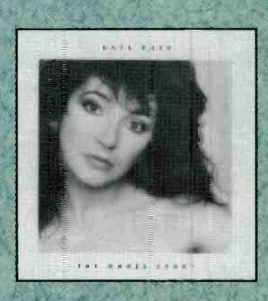
Produced by Kate Bush