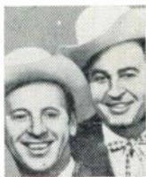
JOHNNIE & JACK