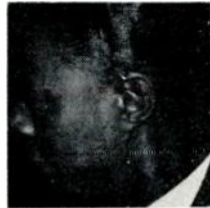
NAT "KING" COLE