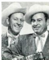
JOHNNIE & JACK