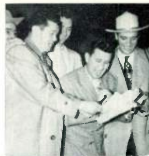
Pee Wee King, center, clowning as he reads of Roy Acuff's retirement from cross country musical travels. With him are Acuff, left; Ernest Tubb, right, and behind him, Carl Smith. King came to Nashville's Grand Ole Opry in 1937—a year ahead of Acuff and Tubb in 1913.