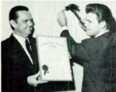
Kentucky is the secret word (or place) here as music vet Merle Travis, left, shares Glen Campbell who is currently riding the sales crest of his bluegrass-tinged version of the Travis written "Kentucky Means Paradise."