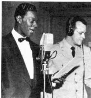
Nat Cole takes time from a busy schedule to aid in the plea for volunteers for the Ground Observer Corps, taped for weekly Air Force show, "Look To the Skies."