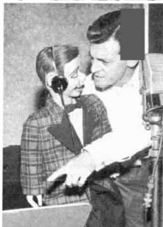
Paul Winchell tells Jerry Mahoney he's not singing correct notes on "X" recording, "You're So Much a Part Of Me," Jerry says "Anything You Can Do I Can Do Better."