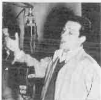
Perry Como emotes generously for Victor on his recent disk, "Hit and Run Affair." Two "mikes," yet.