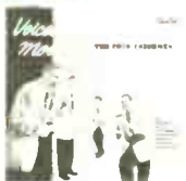
FOUR FRESHMEN Voices in Harmony ALBUM NO. 522