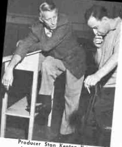
Producer Stan Kenton listens with pianist Claude Williamson to the playback of Claude's first release on Capitol's "Kenton Presents" series, "All God's Chillun Got Rhythm."