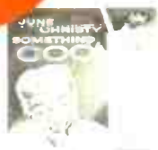
JUNE CHRISTY Something Cool ALBUM NO. 516

But don't wait for tomorrow, lad... get 'em today!