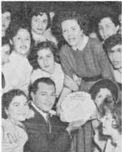
One of Tony Martin's fan clubs assists him in celebrating the anniversary of his marriage to lovely dancer, Cyd Charisse, backstage after Martin's summer NBC-TV show.