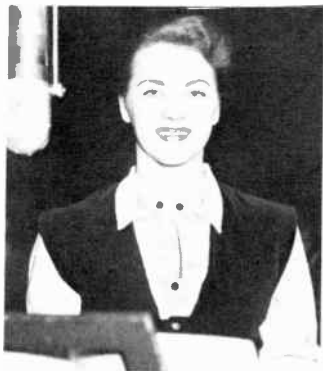
Jeri Southern smiles for the photographer during the Decca record session which produced her version of tune, "The Man That Got Away."