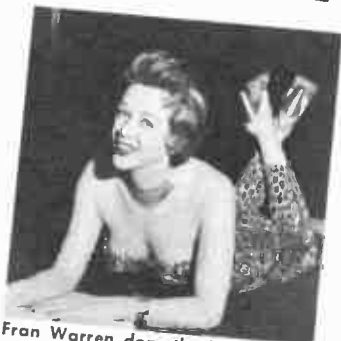
Fran Warren dons the leopard skin uniform and her come-hither look to plug MGM disk, "Love me, Love."