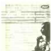
STAN KENTON Showcase - The Music of Bill Holman ALBUM NO. 526