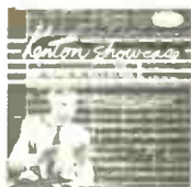
STAN KENTON Showcase ALBUM NO. 525