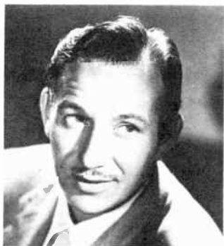
Roger Wagner, whose choral groups have garnered top kudos both here and abroad, conducts his singers through a brand new Capitol album titled "Songs of Stephen Foster."