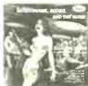
ELLA MAE MORSE House Boogie and 'nuff more ALBUM NO. 532