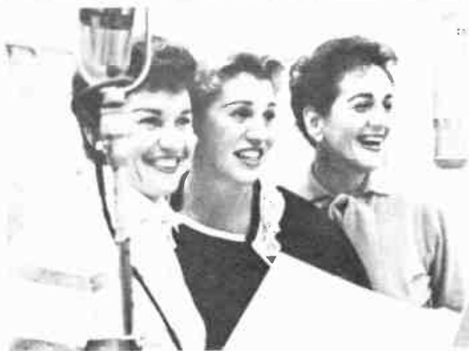
At Capitol studios in Hollywood, the Andrews Sisters make new album of some of their biggest hits in "The Andrews Sisters In Hi-Fi."

It should be interesting to see the stage-door Johnnys greeting their favorite chorine with a bouquet of flowers and saying, "Hello, Doc."