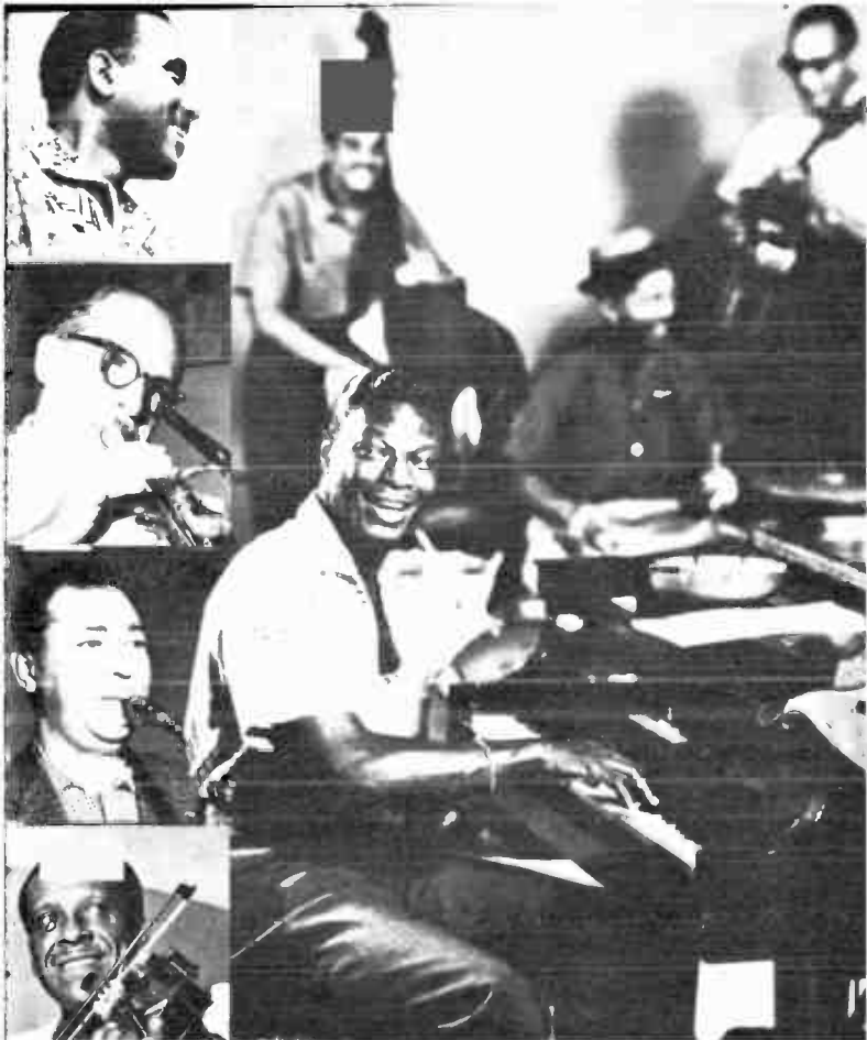
Nat "King" Cole and his trio got together again for a new Capitol album, "After Midnight." Nat's at piano, Charlie Harris bass, Lee Young drums, and John Collins guitar. Guest instrumental soloists (from top): Harry Edison, Juan Tizol, Willie Smith, Stuff Smith.