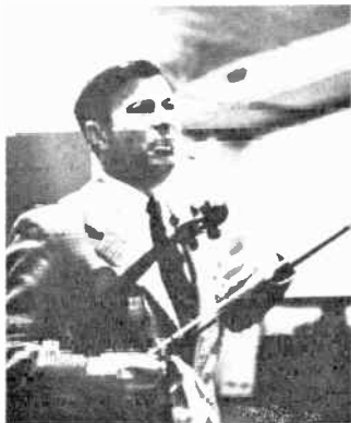
Nathan Milstein, above, with the Concerts Arts ork, plays Mozart's "Concerto No. 5 In A Major" and Bach work in new Capitol album.