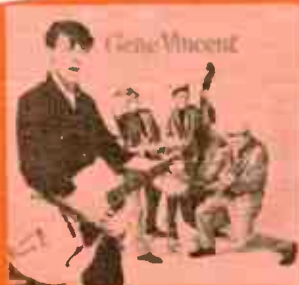
GENE VINCENT AND HIS BLUE CAPS