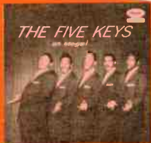
THE FIVE KEYS ON STAGE! • T-828

YOU'LL FLIP OVER THESE NEW TEEN-SPECIALS!