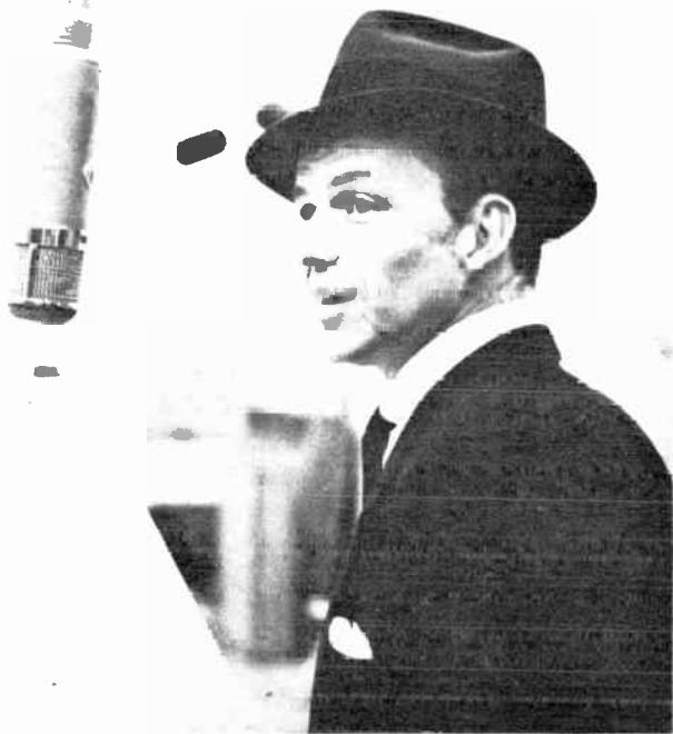
Frank Sinatra offers dozen tunes in new Cap album, "Close To You," conducted by Nelson Riddle, featuring the Hollywood String Quartet.