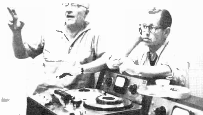
Two top Capitol artists combine their talents in new album simply titled "'Pee Wee' and 'Fingers'" and their names are, from the left, "Pee Wee" Hunt and Joe "Fingers" Carr. They are shown in recording control room at Capitol Tower studios in Hollywood discussing tunes.