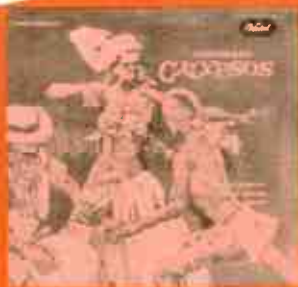
CARIBBEAN CALYPSOS • LORD BEGINNER, TONY JOHNSON and THE TORPEDO • T-10071