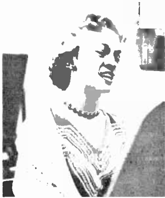
Photographer catches Jean Shepard at mike as she cuts newest disk for Capitol, "If You Can Walk Away." It's in stores now.