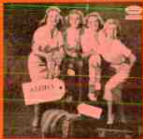
ALOHA • THE KING SISTERS • T-443