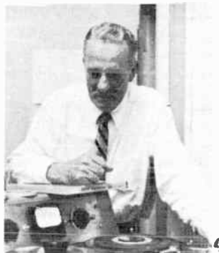
Listening intently to tape playback of track from his new Capitol "Casa Loma In Hi-Fi" album is noted maestro, Glen Gray.