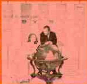
'ROUND THE WORLD WITH LES BAXTER LES BAXTER • T-1780