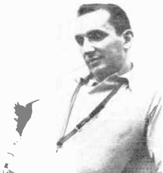
A new Capitol album appropriately called "Blue Serge" stars some fancy jazz instrumentation by Serge Chaloff, here taking break.