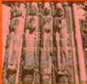
THE HOUSE OF THE LORD • THE PEOPLE'S WAGNER CHORALE • P-8365