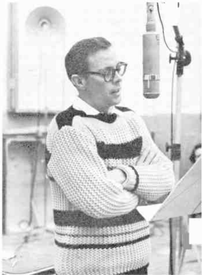
Such favorites as "Imagination," "Moonlight Becomes You," and "The Way You Look Tonight" are on Dick Haymes' Cap album, "Moondreams."