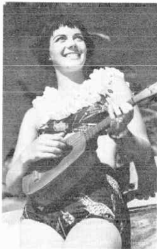
Strumming an Hawaiian tune while enjoying a recent vacation in the Islands is the teenage favorite, Natalie Wood, Warner Bros. star.