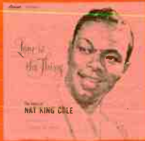
LOVE IS THE THING NAT KING COLE • W-107