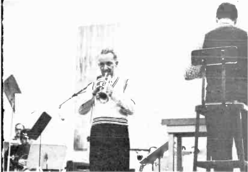
Red Nichols, whose life story is being filmed by Paramount, here is in midst of making newest Capitol hi-fi album, "Hot Pennies."

MORAL: Absolutely none. Just thought it was time somebody pointed out that in this business you can work hard, sweat, save, pull strings, have connections, get the breaks and STILL end up a dismal failure.