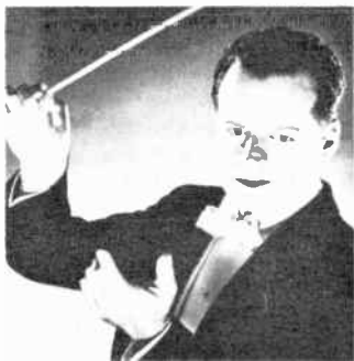
With baton upraised, Carmen Dragon conducts the Hollywood Bowl Symphony in its newest album presented by Cap label, "Nocturne."

The next time a Highway Patrolman writes you out a ticket, don't be surprised to hear him humming the theme music from the TV film series "Highway Patrol." Disks of the tune, waxed by Cyril Stapleton, have been sent by Broderick Crawford, star of the series, to the brass of all the State Patrols in the country. The highwaymen are urged to adopt the tune as their marching song.