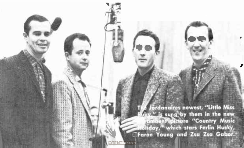
The Jordanaires newest, "Little Miss Ruby" is sung by them in the new Paramount picture "Country Music Holiday," which stars Ferlin Husky, Faron Young and Zsa Zsa Gabor.