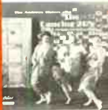
THE DANCING 20'S • THE ANDREWS SISTERS

A sparkling new Andrews Sisters approach, to set you singing and dancing to these wonderful hit songs from the "Roaring 20's." World Radio History T973