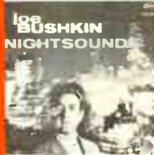
NIGHTSOUNDS • JOE BUSHKIN

Direct from the soundtrack, here's Danny Kaye in frolicking, fun-filled songs from the MGM motion picture... coupled with Billy May's "Music From The Big Top." T1016