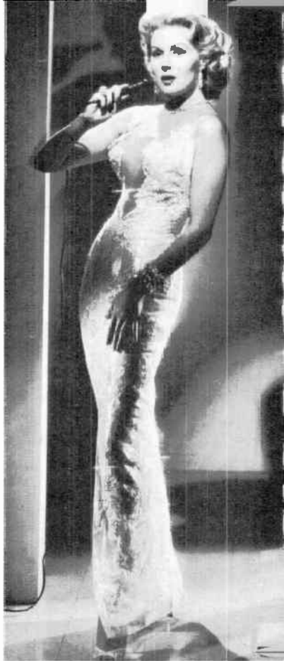
Red-haired actress Rhonda Fleming turned songstress recently & etched an album for Columbia which had the descriptive tag, "Rhonda."

According to the survey, many hospitals have climbed on the music bandwagon with all but critical cases having music piped in. One New York doctor opines that Viennese waltzes are best for maternity cases, musical comedy for accident and operative cases and formless, beat-less impressionist works best for lung cases. (so they don't unconsciously hum or keep time).