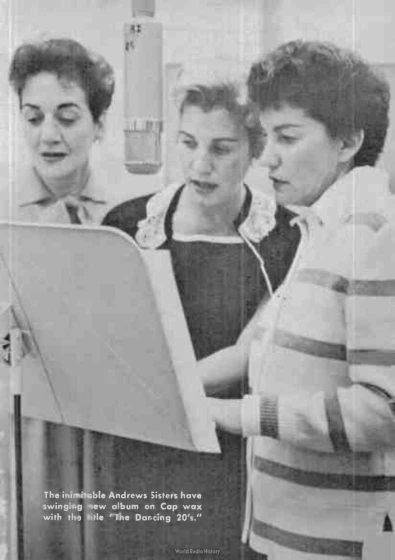
The inimitable Andrews Sisters have swinging new album on Cap wax with the title "The Dancing 20's."