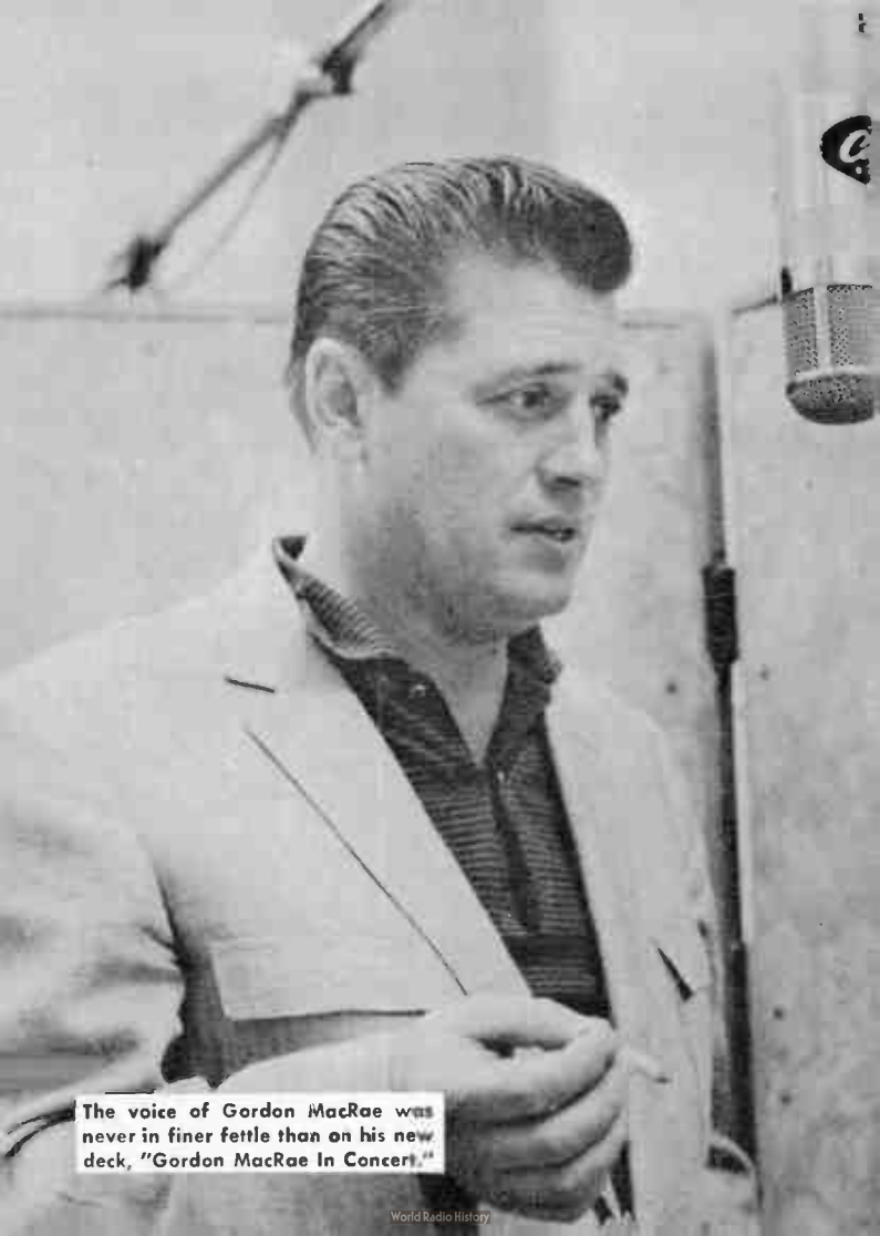
The voice of Gordon MacRae was never in finer fettle than on his new deck, "Gordon MacRae In Concert."