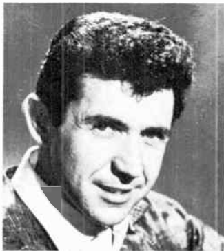
Southern Gentleman, Sonny James has new Cap album titled "Honey."

A new English LP by the Elizabethan Players is reported to contain two songs written by King Henry VIII "in between moments of passion" and a song written by Anne Boleyn. The Boleyn opus is titled "Oh Death, Rock Me Asleep," written shortly before her head rolled. Get it? Rock and Roll? Oh well.