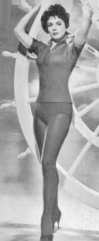
Songstress Erin O'Brien makes dramatic debut opposite Andy Griffith in Warner Bros.' pic, "Onionhead."