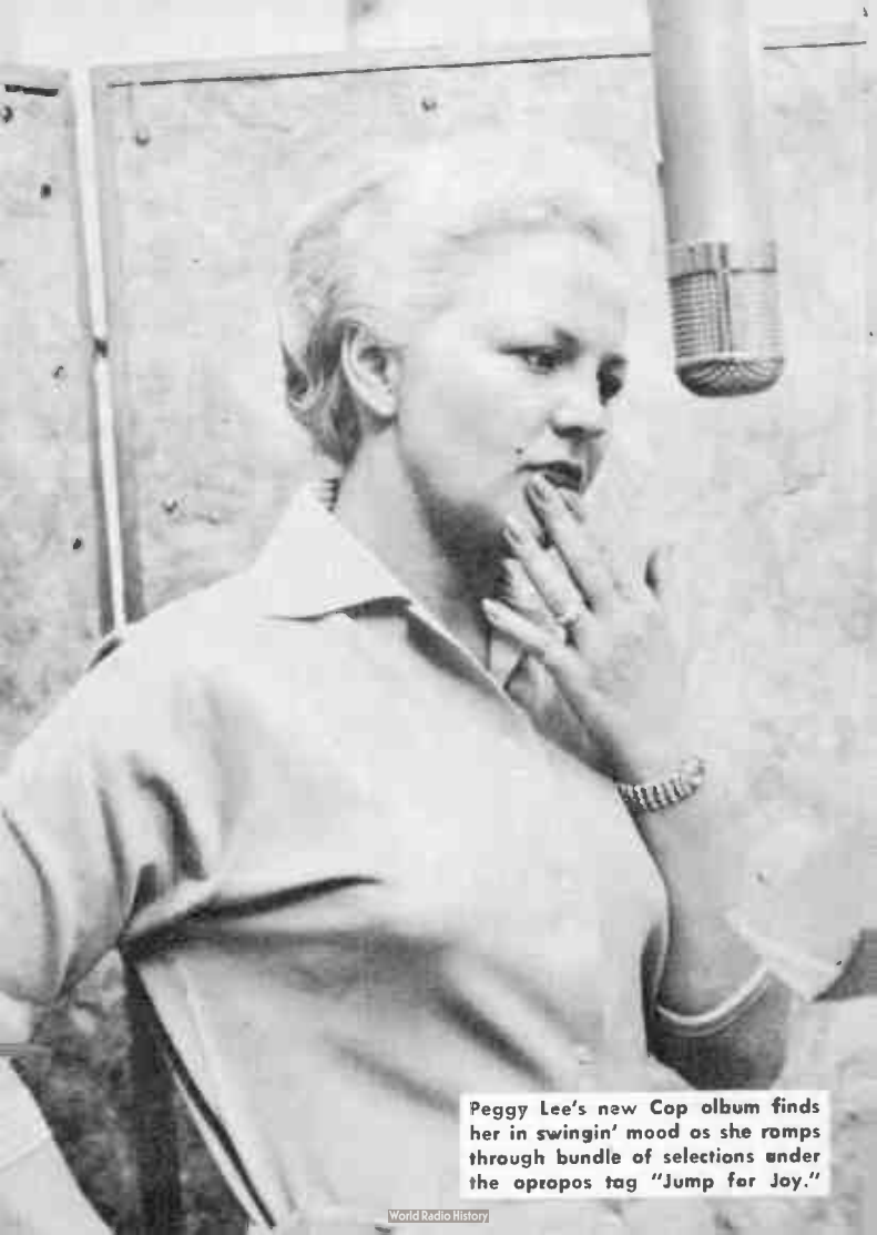
Peggy Lee's new Cop album finds her in swingin' mood as she romps through bundle of selections under the apropos tag "Jump for Joy."