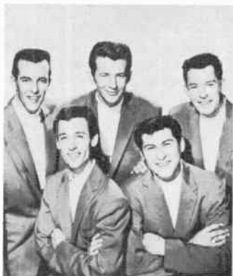
The Champs, recording on Challenge label, scored TKO in first round with their smosh woxing "Tequillo."