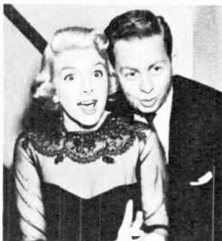
Rosemary Clooney recently played hostess to Mel Torme, once known as "The Velvet Fog," on recent edition of Miss Clooneys TV stcnza.

Increasing activity by schools and community orks is given as a prime factor.