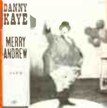
MERRY ANDREW • DANNY KAYE

A sparkling new Andrews Sisters approach, to set you singing and dancing to these wonderful hit songs from the "Roaring 20's." World Radio History T973