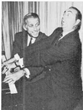
Stan Kenton was recent guest of Willard Waterman on the latter's TV show, "The Great Gildersleeve."

Grownups seem to have been lost in the rush by radio and TV stations to stage "hops" and dances for teenagers, so WAVY-TV in Norfolk, Virginia, is correcting the situation by staging a "Dancin' for Grownups" show. The "elders" dance to the music of their own generation, swing. The station is making no claim to curb senile delinquency.