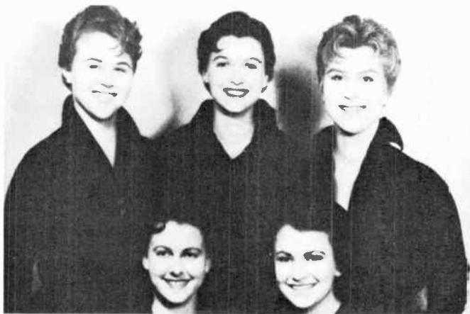
These five belles from Southeastern University are known as the Chants and make their wax debut on Cap with "Lost and Found," "Close Friends."