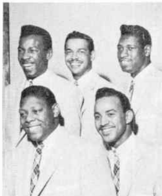
Looking for that big one, the Five Keys have a strong contender in their latest disk, "You're For Me."