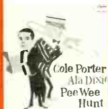
COLE PORTER A LA DIXIE • PEE WEE HUNT

Musical highpoints of a fabulous and versatile career, in a newly-recorded collection of songs made famous by Sinatra himself! W982