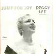
JUMP FOR JOY • PEGGY LEE Peggy Lee, backed by Nelson Riddle, in a happy selection of songs ideally suited to her relaxed and swinging style. T979

The happiest sounding Dixieland ever, as Pee Wee meets Porter in an all-out, Dixie session that really walks along! T984