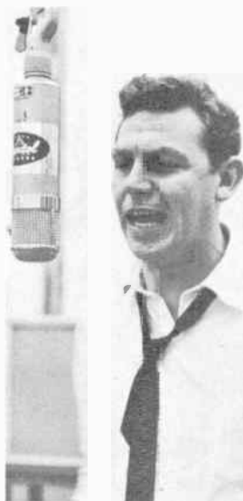
The MGM picture "Gigi" is source of Andy Griffith's cute new platter, "Thank Heaven for Little Girls."

Deejays across the country were the recent recipients of a gift from Mercury Records: a "do-it-yourself" Voodoo kit! The kit contained a Haitian doll, needles, chicken feathers and pin-sticking instructions, and was meant to plug the company's "Voodoo Man" disk.