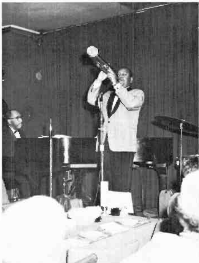
Trumpeter Jonah Jones performs excerpts from his skyrocketing new album, "Swinging on Broadway," during his recent opening at the London House in Chicago. Album looks bigger than his "Muted Jazz" package.