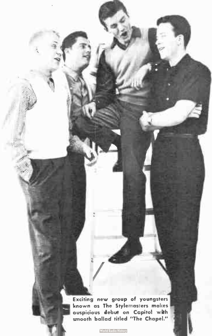
Exciting new group of youngsters known as The Stylemasters makes auspicious debut on Capitol with smooth ballad titled "The Chapel."