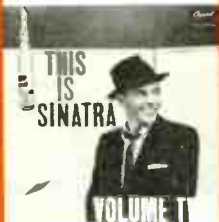
THIS IS SINATRA, (vol. 2) • FRANK SINATRA

Musical highpoints of a fabulous and versatile career, in a newly-recorded collection of songs made famous by Sinatra himself! W982