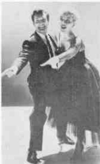
Hugh O'Brian plugs new ABC-Paramount album, "Hugh O'Brian Sings Wyatt Earp" on recent stanza of Patti Page's "Big Record" CBS-TVer.

There are those who ask the question, "Will anyone be paying attention to her voice?"