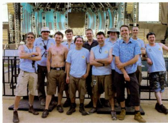
THE U.K.-BASED HSL lighting team proudly stands in front of their creation, which required moving 36 tons of equipment, for Robbie Williams' April 21 gig at Nad Al Sheba horserace track in Dubai. It was the fastest sellout ever for the United Arab Emirates and seated 23,000 fans.

INXS's first Australian tour in a decade saw two Sydney shows and a Melbourne date sell out in its first day.