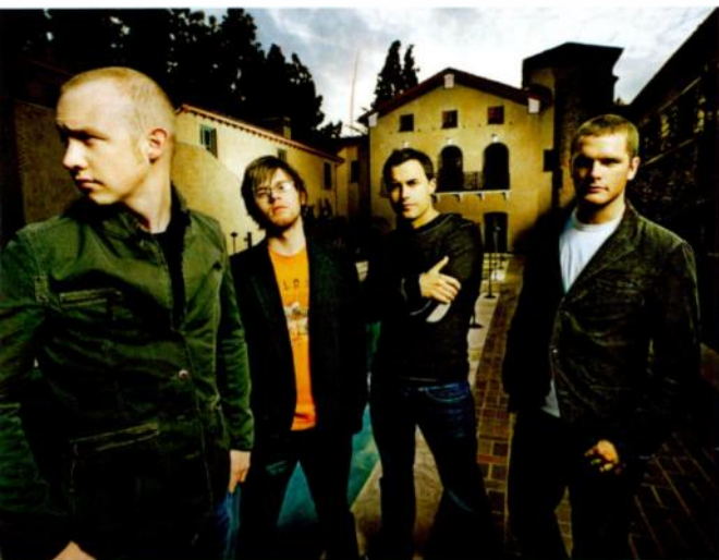
L-R: Isaac Slade, Dave Welsh, Joe King & Ben Wysocki