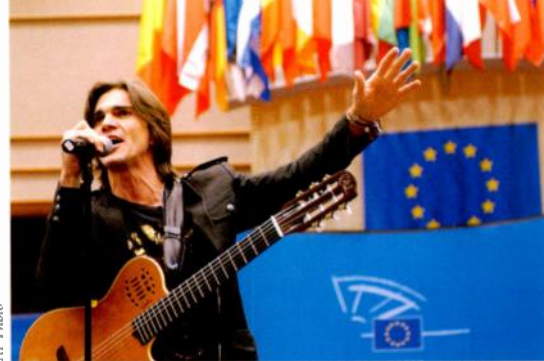
COLOMBIAN STAR JUANES continues his mission against land mines with a performance at the European Parliament in Brussels, Belgium, April 19. He is the first musician invited to perform at the auditorium, which is usually reserved for world leaders and parliament members.