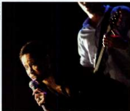
JOHN REZNIK of the Goo Goo Dolls mugs for the camera during the band's set at The Rave/Eagles Club in Milwaukee April 17th.