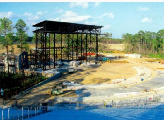
CONSTRUCTION CONTINUES on the 10,000-capacity Amphitheatre at the Wharf in Orange Beach, Alabama. The shed, part of a 220-acre mixed-use resort, is scheduled to open May 27th with a Hank Williams Jr. concert.

O2 World will have a total area of 60,000 square meters, with dimensions of 160 meters by 130 meters wide, and 35 meters tall. The cost of construction is estimated at euro 150 million.