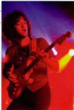
THE STROKES guitarist Albert Hammond Jr. casts an ethereal glow at San Francisco's Concourse March 24th.