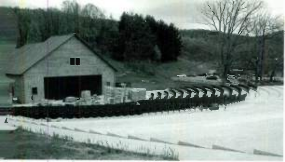
WORKERS INSTALL SEATS – with cupholders – at the $1 million Mountain Lakes Amphitheatre in Flatwoods, W.Va., last month in preparation for its May 20th opening concert with John Anderson. The 2,000-seat shed will host gospel, bluegrass, country and oldies acts through October.

April, but Hurricane Katrina thwarted those plans. The team delayed its inaugural season until 2007.