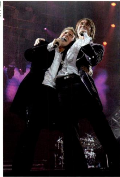
TAKE THAT'S Gary Barlow and Mark Owens share a close moment at the Metro Radio Arena in Newcastle, England, April 23. Take That now performs without Robbie Williams.

This year's ceremony will be at London's Grosvenor House May 25.