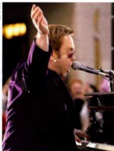
CELEBRATING the Broadway opening of " Lestat ," Sir Elton John makes an appearance on NBC's " Today " show at New York's Rockefeller Center April 25th.