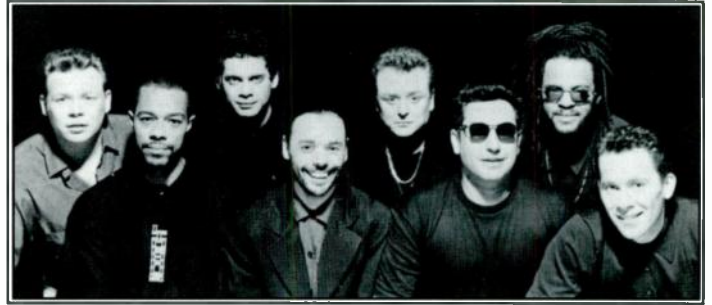
UB40 members (L-R) All Campbell, Earl Falconer, Michael Virturo, James Brown, Brian Travers, Norman Hassan, Astro, and Robin Campbell.

UB40 does not exist to be a political messenger. One of their original intentions as a band was to popularize reggae music and, according to lead singer and trumpet player Astro, they are starting to see the fruits of their labor. UB40's highly accessible reggae-fied covers of familiar pop songs are blowing open the door for reggae music on the radio. But UB40 isn't "just" a cover band, even though many perceive them to be. Astro said UB40's reputation as a cover band continues in America because of the success of their Labour of Love I and Labour of Love II albums. UB40 has released 13 albums of original work, including the new release on Virgin Records, Promises and Lies . But the perception of them as a cover band is hard to shake due to their current hit single, "Can't Help Falling In Love," which is the only cover tune on the new album, and their reggae versions of Neil Diamond's "Red Red Wine," and Sonny & Cher's "I Got You Babe," which featured guest vocalist Chrissie Hynde.