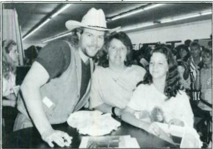
Twenty-four thousand fans turned out at the Tennessee State Fairgrounds for the 23rd annual International Country Music Fan Fair . When the dust settled, the fans went home leaving $9 million behind for tickets, travel costs, lodging and the ultra necessity — souvenirs. Pictured here are two fans as they get autographs from fast rising Polydor star Toby Keith .