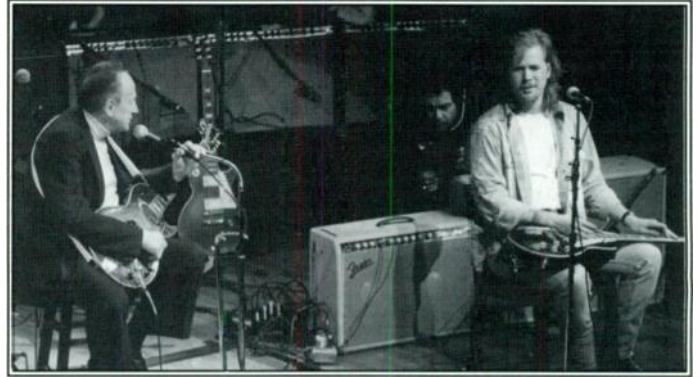
The House of Blues in No. Hollywood was the setting for a May 19th tribute to the "Godfather of the Electric Guitar," Les Paul. The evening included appearances by Jeff Healey (pictured with Paul), Slash, Steve Vai, Johnny Rivers, Dave Edmunds, Stephen Stills and Graham Nash. The festivities were filmed by Time Warner Television and will be included in a documentary series called "The History of Rock 'N' Roll," which will air next year.