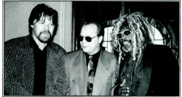
As part of the 1994 Motor City Music Awards, several Lifetime Achievement Awards were presented May 20th at the State Theatre in Detroit. Bob Seger was there to congratulate honorees Mitch Ryder (C) and George Clinton (R).