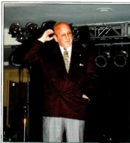
Arista Records president and founder Clive Davis ponders a question from the audience during his keynote speech, which was also an open forum. Canadian Music Week was held March 4-10.