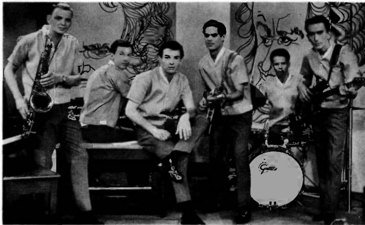
VANCOUVER'S CLASSICS. Popular West coast group appeared recently on Music Hop from Vancouver, Group records for the Jaguar label. Latest release "'Till I Met You."

"This is an excellent Canadian sound well deserving of really heavy air-play on stations coast to coast. The Esquires have tried before with singles and an album, but so far have met with only moderate success...they need a hit single to establish themselves nationally and this could be it."