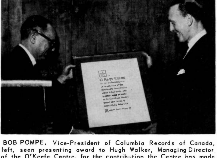
of the O'Keefe Centre, for the contribution the Centre has made in assisting the Canadian theatre.