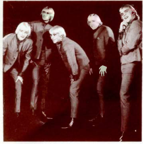
Popular Montreal based group Les Houlops Tetes Blanches.