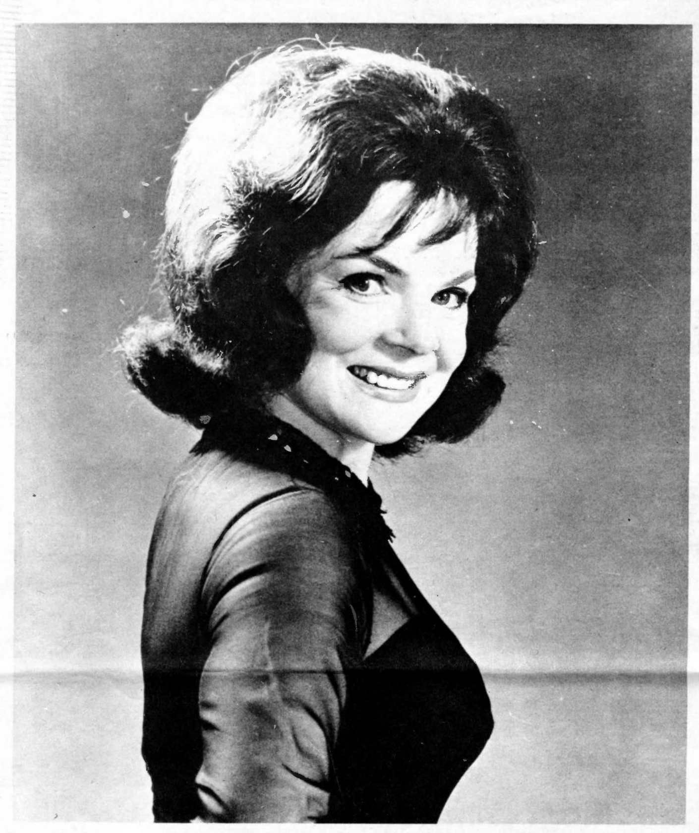
ON COLUMBIA RECORDS ®