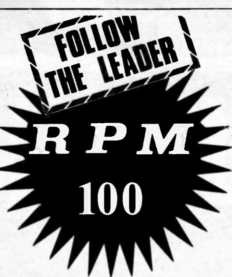
Chart # 58