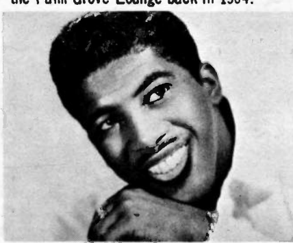
BEN E. KING