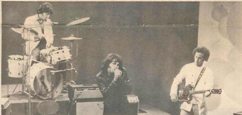
Jefferson Airplane (Top) and The Doors are set to happen on CBC-TV's "O'Keefe Centre Presents"