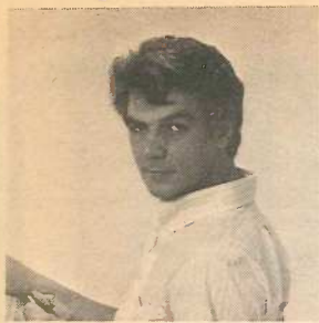
BY STAN KLEES (Guest Columnist)