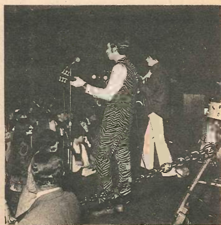
LORDS OF LONDON