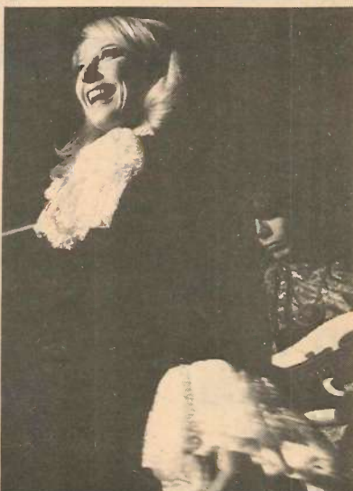
3'S A CROWD IN ACTION AND IN CENTRE WITH PRESS AND RCA VICTOR VIP'S