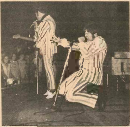
(Top left) The Five Americans have just released "Stop Light" on Abnak. Lulu (top right) is running with hit material with three