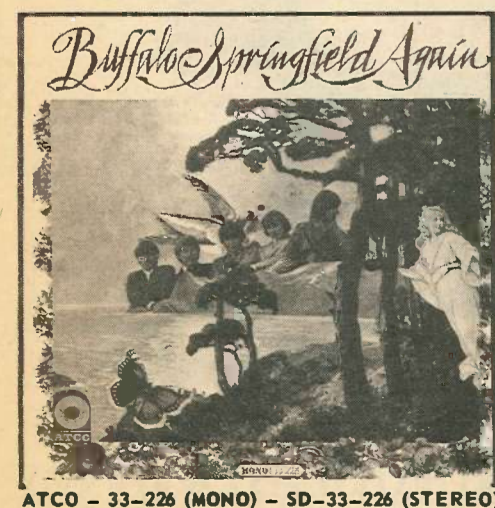
ATCO - 33-226 (MONO) - SD-33-226 (STEREO)

(Radio stations are requested to submit change of personnel and programming information to RPM Music Weekly - 1560 Bayview Ave. Toronto 17.)