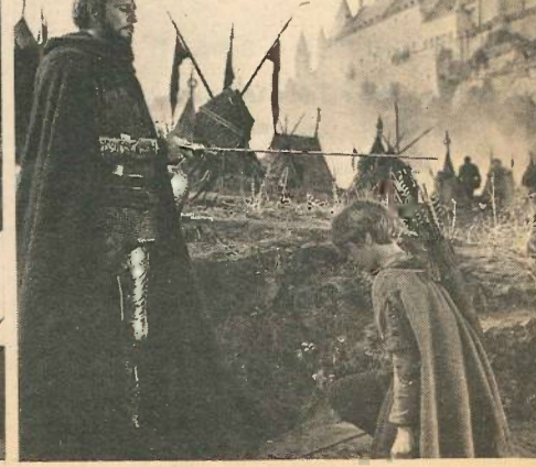
SCENES FROM CAMELOT