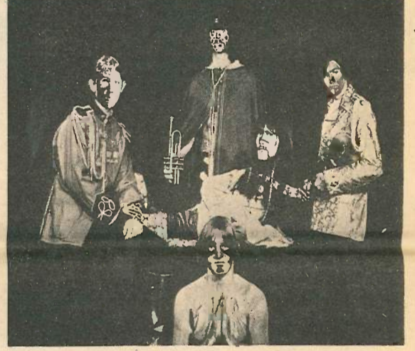
Edmonton's Taitums are Canada's youngest rock groups and are receiving rave reviews wherever they appear.