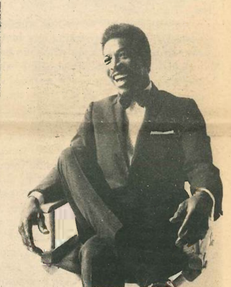
(Top left) The Buffalo Springfield, currently happening with "Expecting To Fly" were recently in concert with Vancouver's Collectors in L.A. (T.R.) Sonny & Cher are catching fire with "Good Combination". (B.L.) The Mothers' Of Invention will be appearing in Toronto Jan 24th. (B.R.) Wilson Pickett is set for a Massey Hall (Toronto) appearance Jan 26 and at Ottawa's Capitol Theatre Jan 28th.