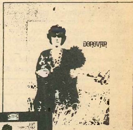
L2N 6071/B2N 171 Stereo

His music, his art, his poetry... all in a magnificently designed volume that includes the two LP's, a beautiful art portfolio, complete lyrics, and full color photographs.