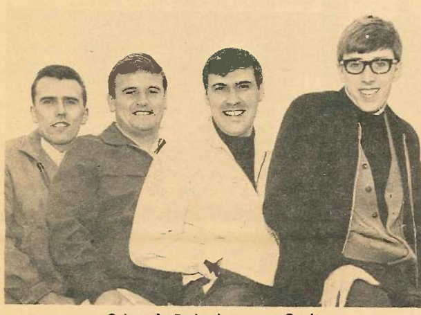
Oshawa's Dril releases on Quality