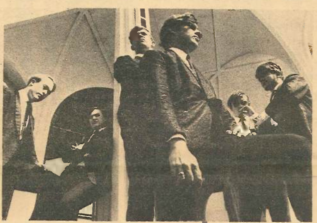
Franklin release for Tradewinds 5 Inc.