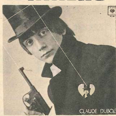
FS 653 BEST JACKET