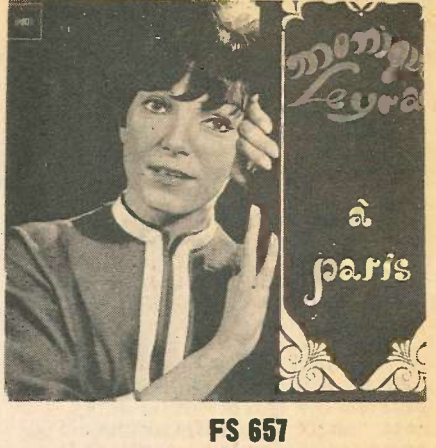
FS 657 BEST INTERPRETATION

DISTRIBUTED BY COLUMBIA RECORDS OF CANADA LTD.