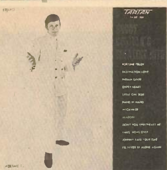
GREATEST HITS/Bobby Curtola Tartan TA 60108. These are the big ones that made Curtola a household word across Canada. "Fortune Teller", "'Hitchiker'' etc. etc.

GRASS AND WILD STRAWBERRIES Collectors Warner Bros/7 Arts WS 1774-P Material written by the group for stage play under same title now playing Vancouver. Originality forceful and sustaining. Word of mouth will be power behind sales.