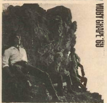
MOBY GRAPE '69 Columbia CS 9696-H Radio action already stirring sales on this item. Group relies on basic rock pattern. Demo play in store could catch sales.

20/20 Beach Boys Capitol SKAO 133-F Off the singles scene for sometime but should chalk up good sales with this one which contains past hits "Bluebirds Over The Mountain" and "Do It Again".