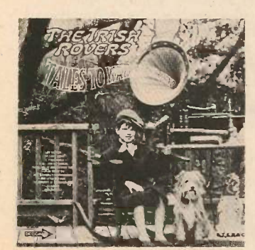
TALES TO WARM YOUR MIND Irish Rovers Decca-DL 75081-J Well displayed should garner much sales. Contains "Lily The Pink".