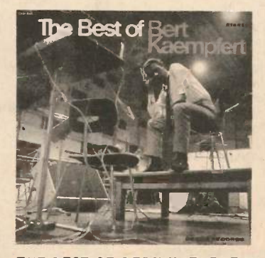
THE BEST OF BERT KAEMPFERT Decca-DXSB 7200-J 2 record set that should create good sales. "Danke Schoen", 'Red Roses For A Blue Lady'' and other past greats.