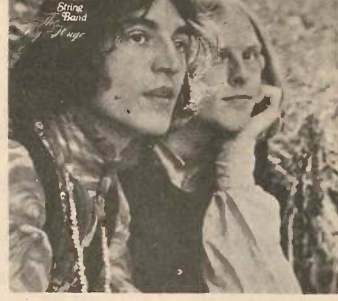
THE BIG HUGE/Wee Tam Incredible String Band Elektra-ELS 74037-C 2 record set of strong English folk/country. Excellent for all