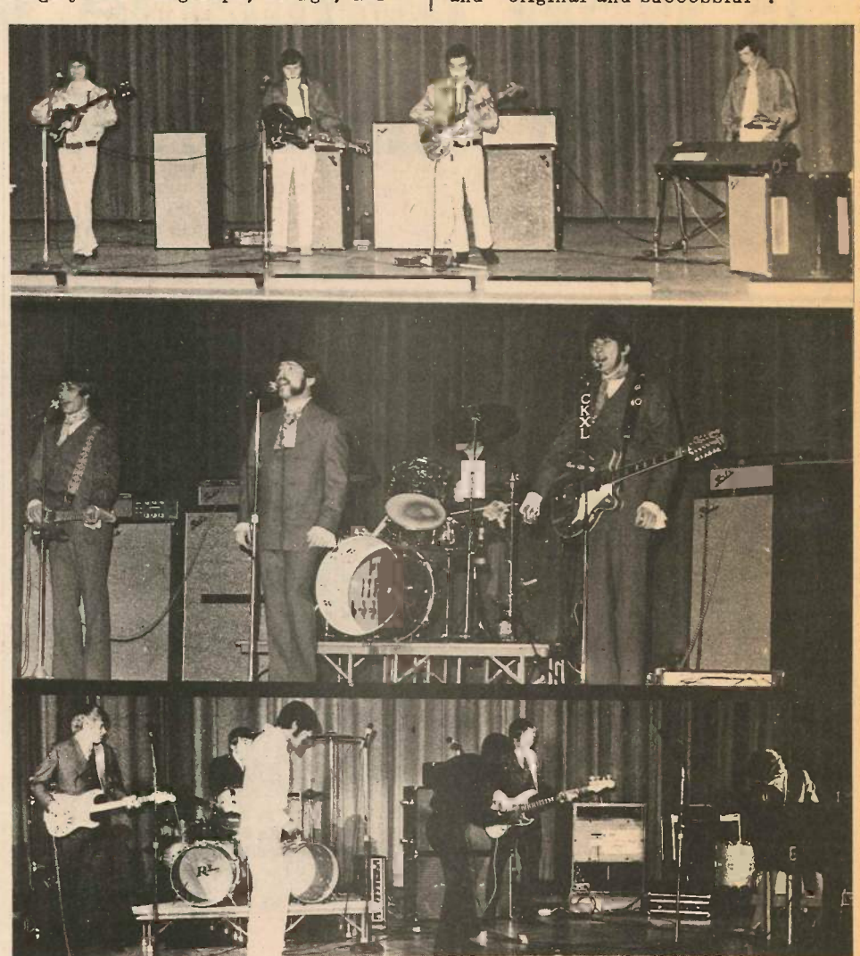
(Top) Capitol recording artists, The Dew Line. (Centre) The Happy Feeling currently happening with their Barry lid of "If There's A Thought", flip of "Happy Feeling" which already made news in Canada and the U.S. (Bottom) The Gallery, who have seen national action with their Apex releases.

Local press were unusually kind to Canadian talent. The Calgary Herald noted "The groups proved that there is a definite Calgary Sound". Comments from other critics ranged from "most exciting", "They showed talent both in creating and performing" and "original and successful".