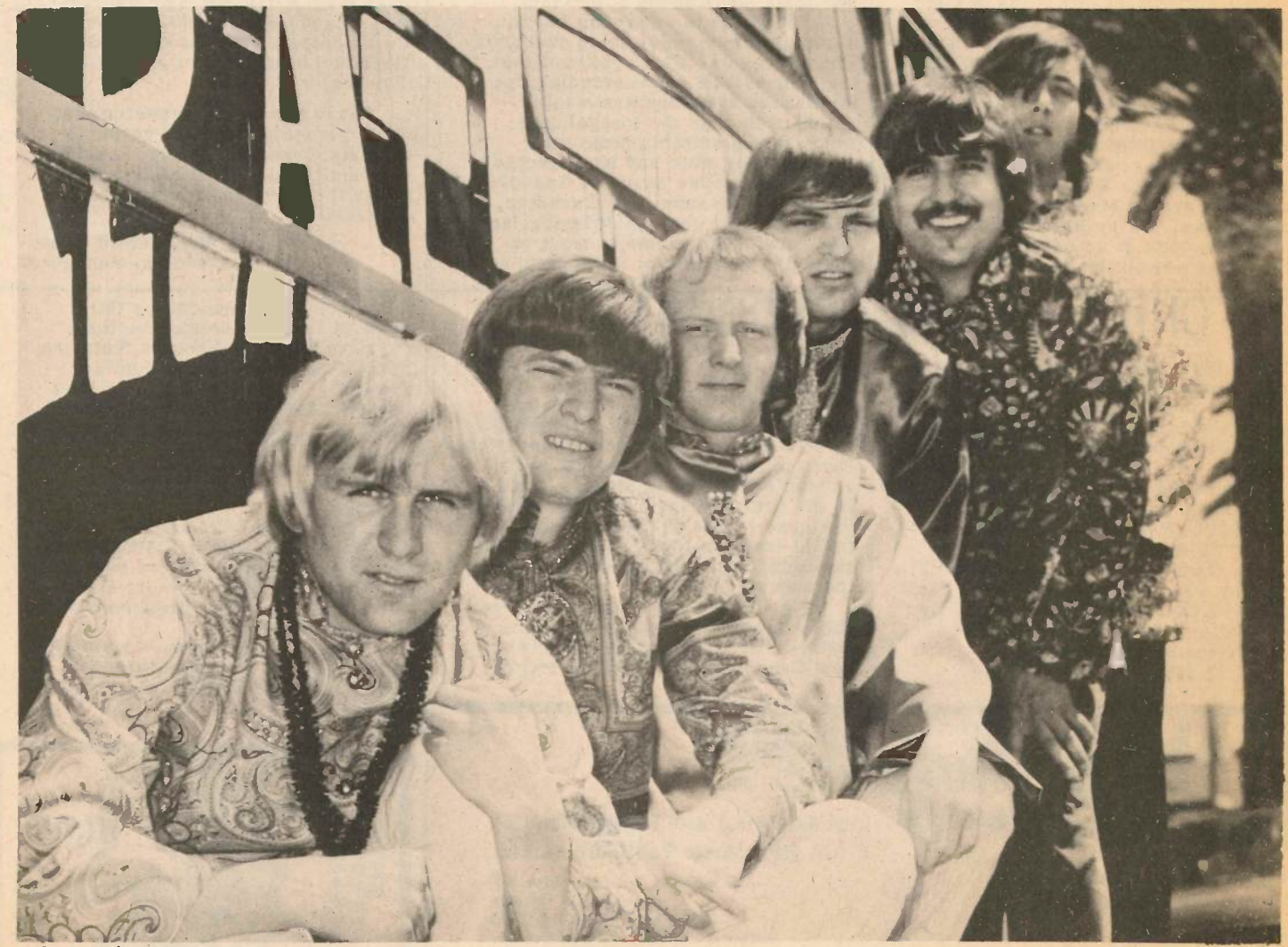
Calgary's 49th Parallel are naw seeing top national action on their Venture single "Twilight Woman", distributed by Quality Records. Considered one of Western Canada's strong-

BMI (CANADA) TO HONOUR CANADIAN COMPOSERS DOD BIG CHIEF BOWS PRODUCT OOD COLLEGE PAPERS TALKING UP O RUMBLE RELEASES CREATES WORLD-CANADA" COMPO APPOINTMENT FOR MATTHEWS ... MARIPOSA DATES SET