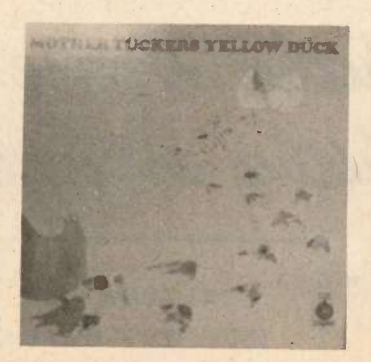
MOTHER TUCKERS YELLOW DUCK Capitol-ST-6304-F Voncouver group already receiving mucho attention with "One Ring Jane" contained on set. Escellent for "progressive format" programming.