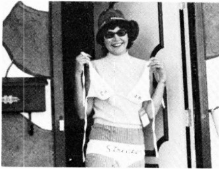
CHAB's Streaker Contest winner models official streaker's outfit.