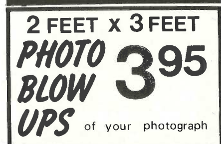
PHOTO POSTERS OF ENTERTAINERS are real attention getters at clubs, concerts, store promotions, personal appearances or anywhere publicity is needed.