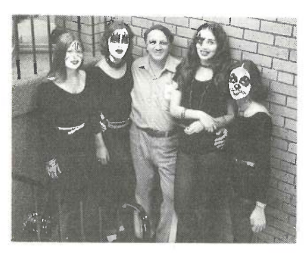
RPM's Sammy Jo lent a hand to the WEA people for a recent promotion on the Toronto appearance of Kiss.

The "Streak" single has now sold over 100,000 units and, according to label, the single hasn't peaked.