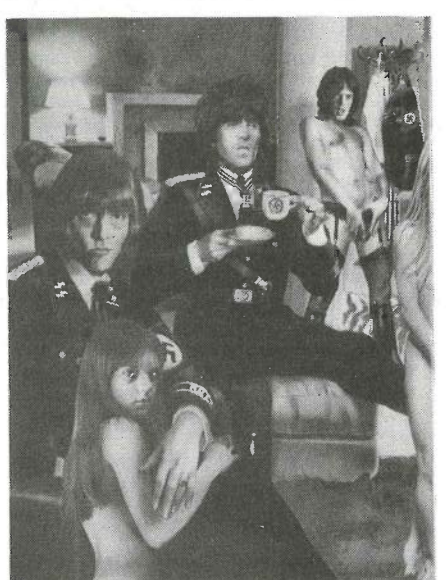
A double page spread depicting the Rolling Stones (from "Rock Dream").