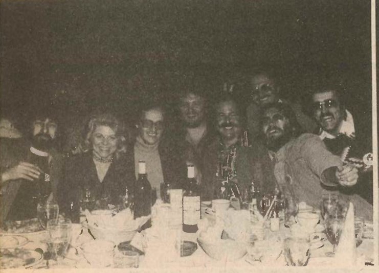
Western revelers added much life to the banquet and showcasing at the Hotel Toronto.