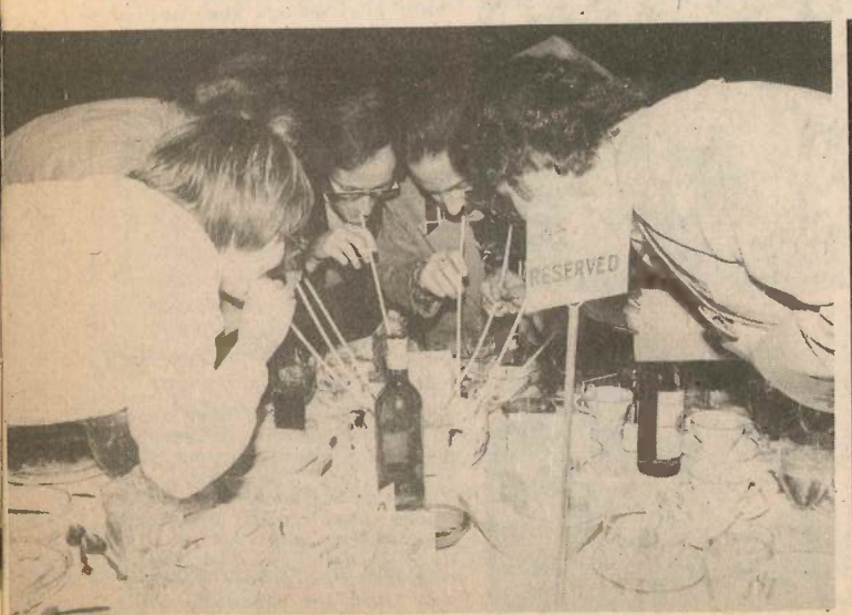
One of western Canada's Scorpions gets the eastern treatment. The drink is a speciality of Trader Vic's.