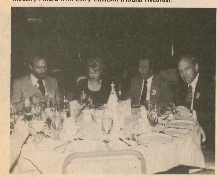
CBC radio (Montreal) reps on far right with other guests enjoying TBC banquet prior to showcasing,