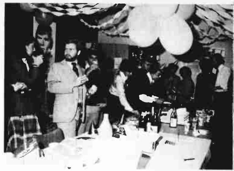
CFCF radio staff and friends sip champagne at station's 58th breakfast party. CFCF was the first to go on air in Canada.