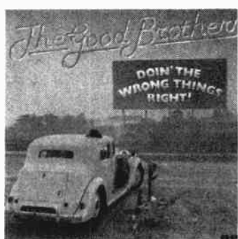
THE GOOD BROTHERS Doin' The Wrong Things Right RCA KKL1-0282-N. Prod. Paul Hornsby in Georgia, Includes current hit, Truck Drivers Girl. Country, pop and rock.

ROSS HOWEY CEGM RICHMOND HILL PLAYLISTED