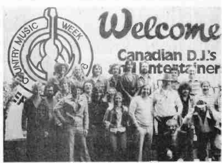
Large Welcome sign at Regina Inn, is backdrop for group of Big Country delegates.