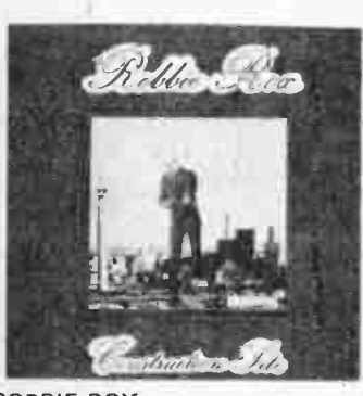
ROBBIE ROX Construction Site - Bent WRC-123-TCD Rock, Unusual Toronto band put out LP on own label, Recorded Midwich Cuckoo Club & Thunder Sound.