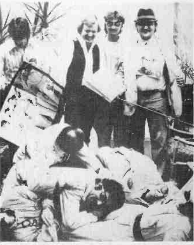
The WEA mutants, in full suburban robot uniform devolve one step further at Q-107.