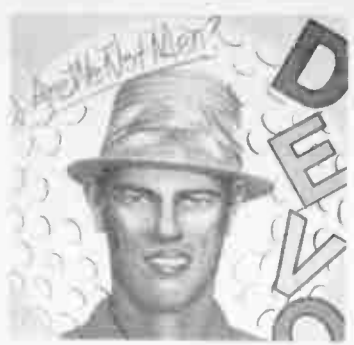
DEVO Q: Are We Not Men? We are DEVO! Warner Bros BSK-3239-P New Wave/prog Ohio group based on de-evolution theme score with prod. Eno. Marble vinyl.