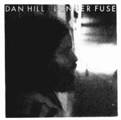
Double Platinum Plus