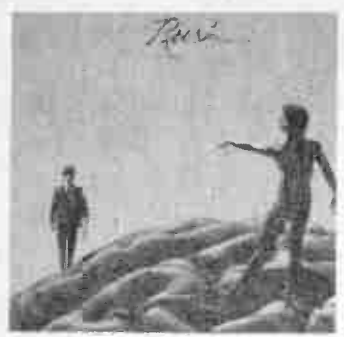
RUSH Hemispheres - Anthem saNR-1-1015-F Rock. New LP by Toronto trio prod. Rush & Terry Brown, Rockfield, Wales. Quite progressive, Red vinyl, lyrics. Side 1 is epic title cut in six parts.