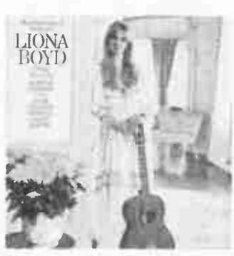
LIONA BOYD The First Lady Of The Guitar ColumbiaMasterworks M-35137-H Classic Boyd's 4th LP, CBS debut, highlights pleces from her favourite composers.