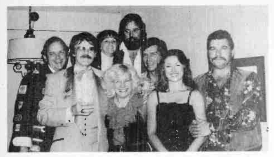
They were all winners at Big Country '78 and they all gathered around each other to show the kind of comraderie that exists in Canadian country.