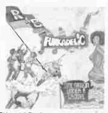
FUNKADELIC One Nation Under A Groove - Warner Bros BSK-3209-P Funk. Interesting concept, outstanding liner notes (inside & out) on solld pure funk LP with E.P.