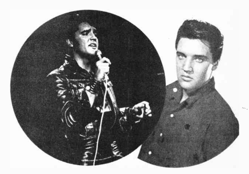
A young and a slightly older Elvis Presley adorn RCA's picture disc