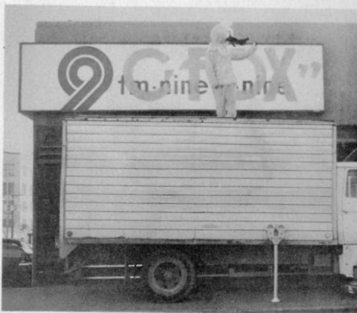
The C-FOX mascot admiring his artwork after painting the new call letters on the FM-99 sign.

At 12 noon on January 6, radio station CKLG-FM in Vancouver signed off the air and, after a two-minute silence, was reborn as radio station C-FOX. The change of call letters is a continuance towards total separation from the station's sister station, CKLG-AM.