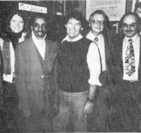
Pablo artist Milt Jackson, vibre virtuoso, joined by RCA staff, Toronto press and media outside Bourbon St. Toronto.

Pablo recording artist Milt Jackson, noted vibraharp player and a leading jazz figure, recently made a highly successful two-week appearance at Bourbon Street in Toronto in late December.