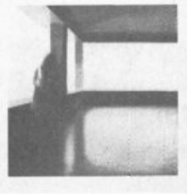
DIRE STRAITS Mercury SRM-1-1197-Q Rock Interesting LP seems to blend new rock with folk, blues. Songs & lead vocals & guitars by Mark Knopfler. British.