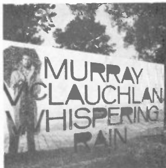
MURRAY McLAUCHLAN Whispering Rain - True North TN-36-H Pop. McLaughlan's 1st self-prod. LP (Eastern Snd & Nashville) blends recent rock with earlier soft pop, country.