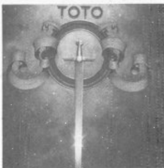
TOTO Columbia PC-35317-H Rock/Pop Very slick, commercial yet energetic sounds from group mostly comprised of the hottest session musicians in L.A.