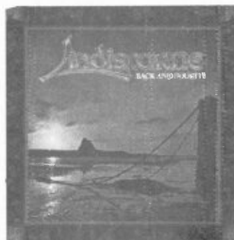
LINDISFARNE Back And Fourth - Atco KSD-38-108-P Pop Very British group show their folk roots with commercial overtones. Incl. their current hit Run For Home.