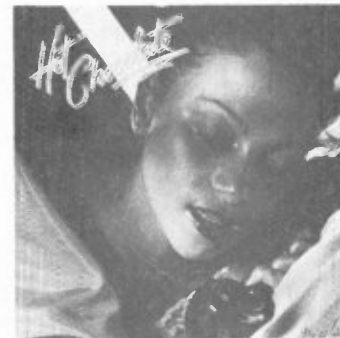
HOT CHOCOLATE Every 1's A Winner - Infinity INF-9002-J Pop/funk. Group's Infinity debut features slick keyboard sound, many hooks, wide range of appeal and title smash.