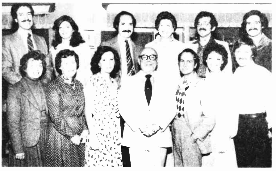
Writers, composers and performers surround Lehman Engel after the sixth annual P.R.O. Canada Showcase of Songs from Musical Shows, Engel is front row centre.

Application forms for next year's workshops, beginning in the fall, are avail able from P.R.O. Canada, 41 Valleybrook Drive, Ontario, telephone (416) 445 8700