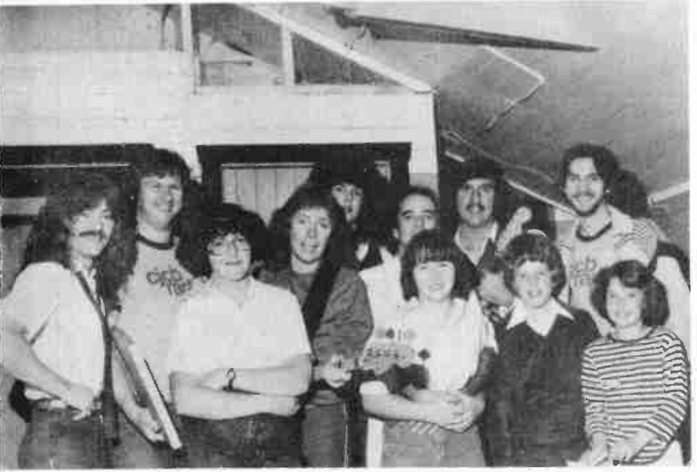
Winners of CJCB's MCA Backstage Pass contest gather for a photo with CJCB jocks and members of recording group Trooper during the Sidney, Nova Scotia leg of their tour.

For reservations and/or appointments to view or hear the Quad Eight Communications Inc., facilities, call 416-961-5530.