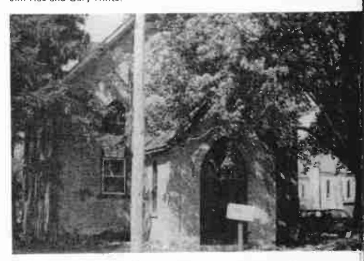
Maxim Studio in Carlingford, housed in a turn-of-the-century Presbyterian Church and supplying a 16-track facility.