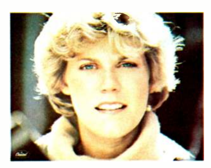
LET'S KEEP IT THAT WAY