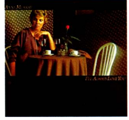
I'LL ALWAYS LOVE YOU