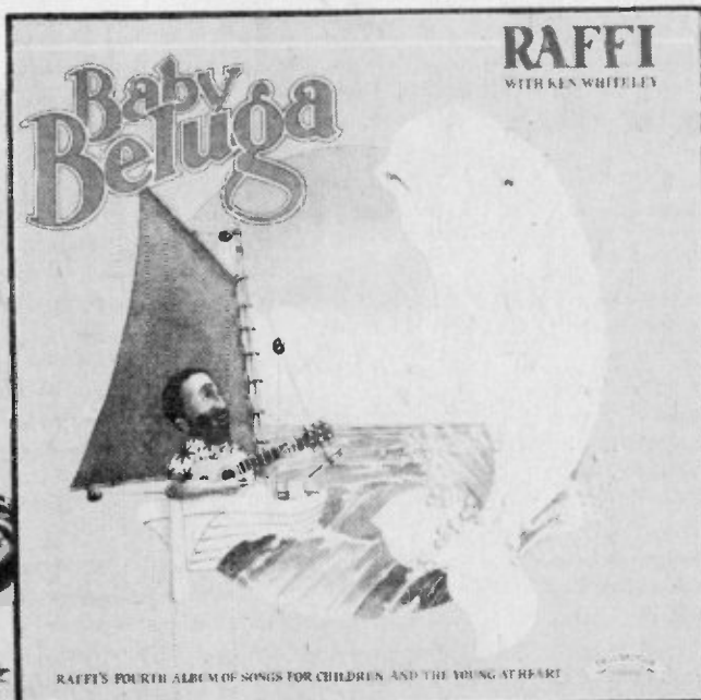
BABY BELUGA TR-0010