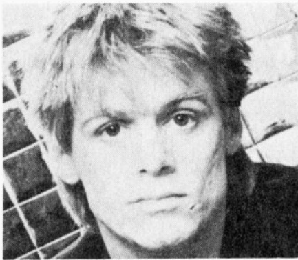
A&M recording artist Bryan Adams

Toronto: A&M recording artist, Vancouver writer-guitarist Bryan Adams, who has been on tour supporting his new album You Want It You Got It , felt that Loverboy has really paved the way for a lot of Canadian bands.