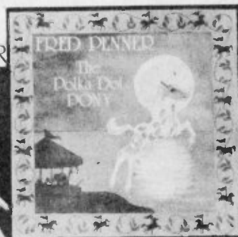
THE POLKA DOT PONY