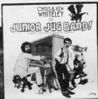
JUNIOR JUG BAND