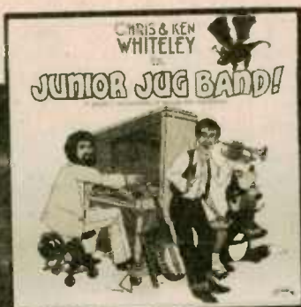
JUNIOR JUG BAND