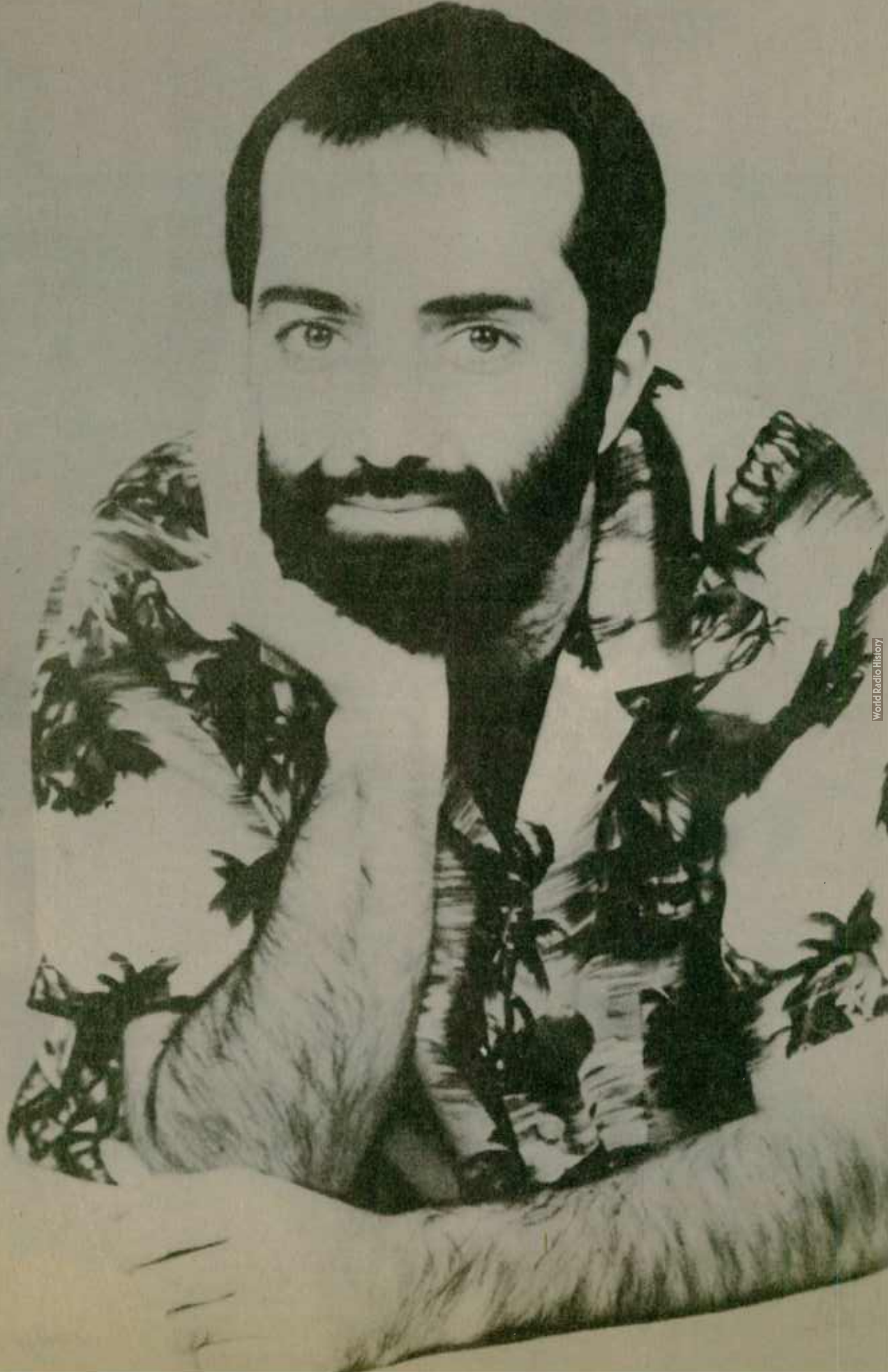
World Radio History