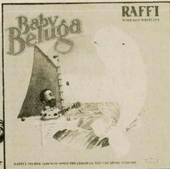
BABY BELUGA TR-0010