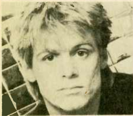
A&M recording artist Bryan Adams

Toronto: A&M recording artist, Vancouver writer-guitarist Bryan Adams, who has been on tour supporting his new album You Want It You Got It , felt that Loverboy has really paved the way for a lot of Canadian bands.