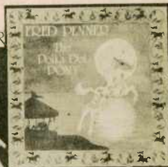
THE POLKA DOT PONY