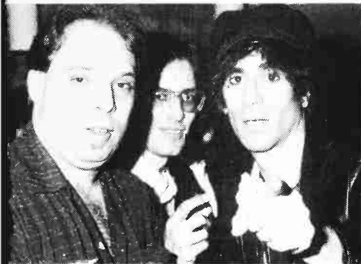
Peter Wolf and SCTV writer Eddy Gorodidsky ham it up for camera.