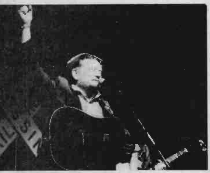
Country superstar Boxcar Willie.