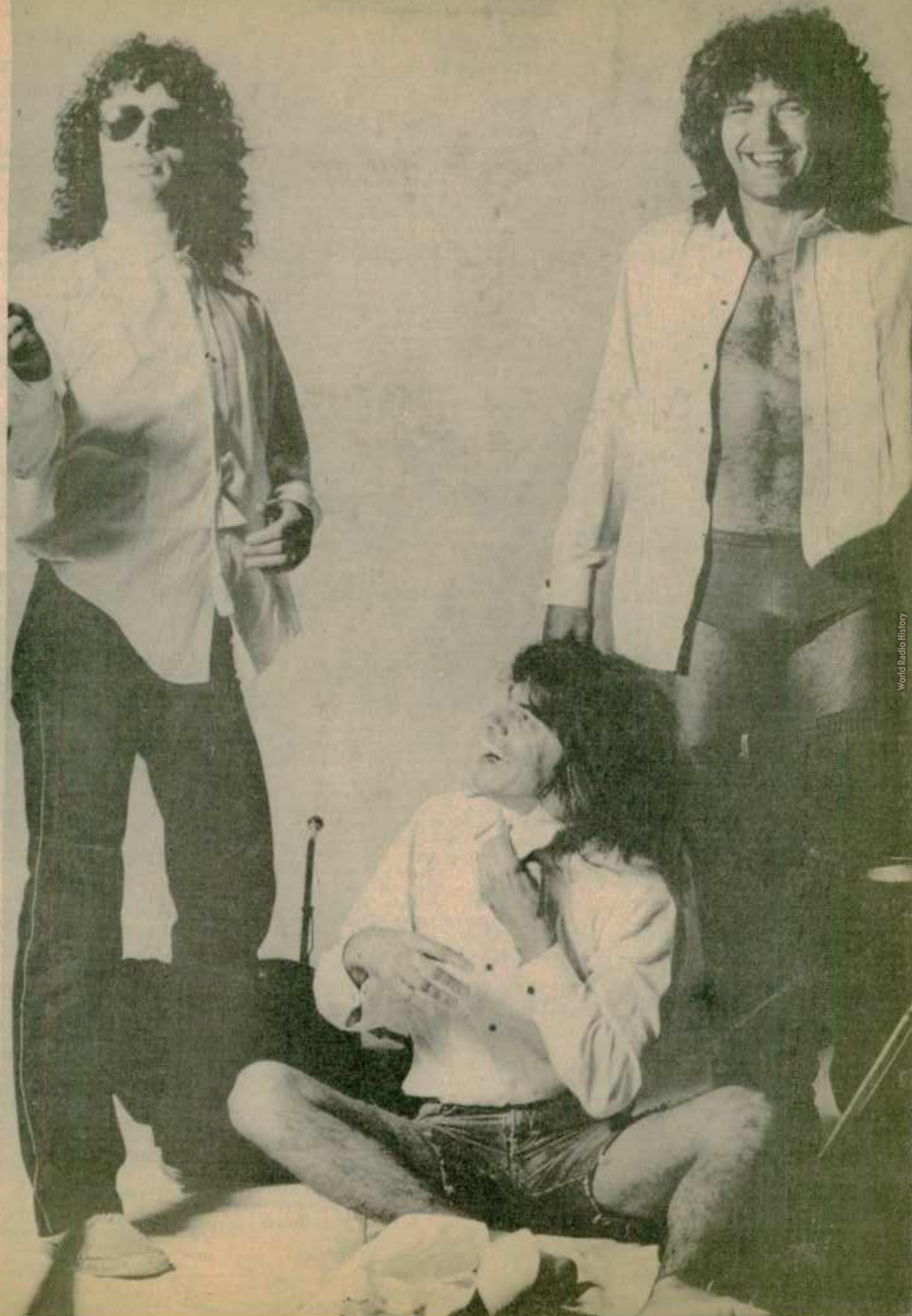
World Radio History