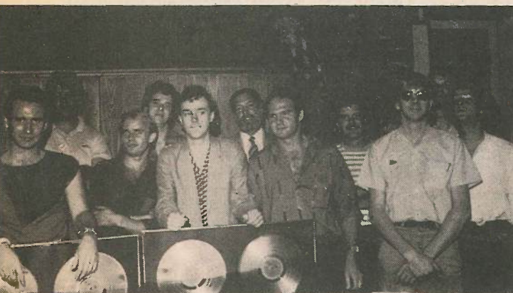
The CBS crew were out in force for the Men At Work date at the CNE where they presented the group with double platinum for Cargo their latest album release.