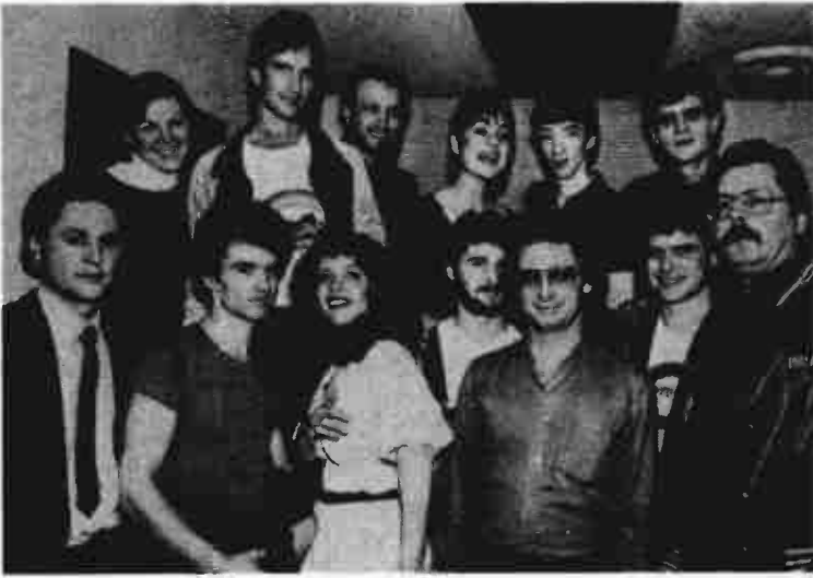
RCA regional reps from Calgrary, Vancouver and Montreal, along with media personalities were on hand for the party.